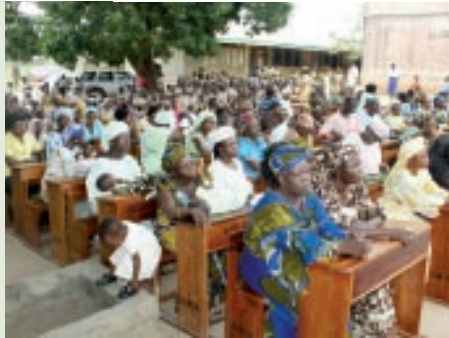
Above Parents at the AUD Primary school speech and prize giving day.

The intervention has brought about an increase in pupil enrolment from 445 to 669 by July 2010, a revitalisation of educational development activities such as speech and prize giving day and active involvement of parents in their children's educational development. A large number of parents attended the speech and prize giving day in July 2010.