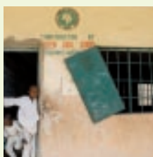
Left and above An example of a Kano school in need of improvements.