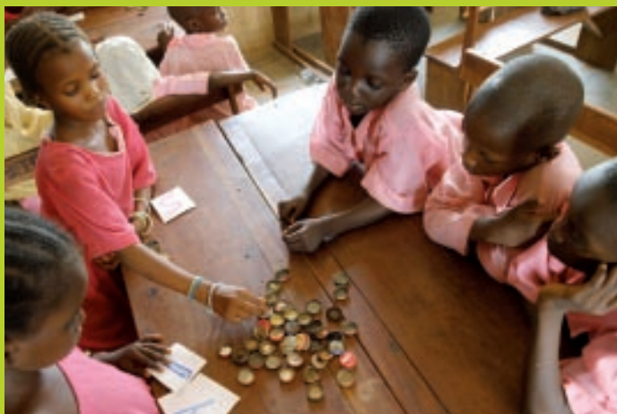
Left Pupils' needs count.