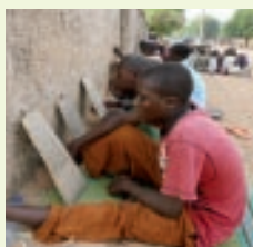
Right, above and left Typical Tsangaya school learning environments.