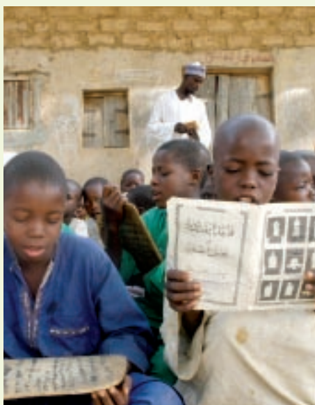
Above Pupils reciting the Koran in a Tsangaya school in Kano State.

The main argument for having such teachers is that in such models, the teachers are not paid a proper salary but receive a token allowance (3,500 naira) and they are allowed to pursue other jobs at the same time. Since SUBEB is not responsible for providing teachers to the Islamiyya and Qu'ranic schools due to financial implications, this strategy is the only way to meet the shortfall in teachers' numbers in the immediate future.