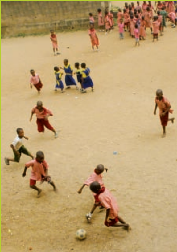
Above Pupils playing football in the spirit of the 1 Goal campaign!