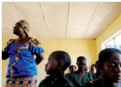
Left Qualified, good quality teachers need to be retained in schools.