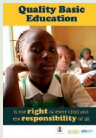
Left and above ESSPIN supported posters for the Access campaign.