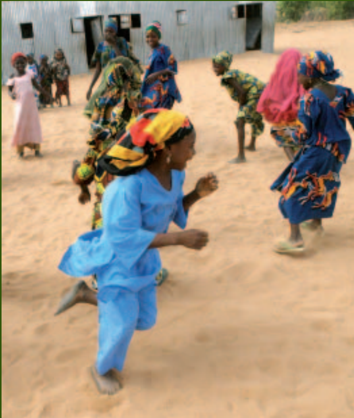
Above Increased enrolment of girls in schools is the aim of the Girls Education Initiative in Jigawa.