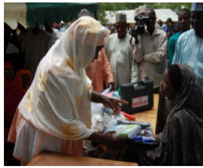
Above: One of the beneficiaries of the GEI pilot project presented with school uniforms and books at Miga (ESSPIN, 2011)