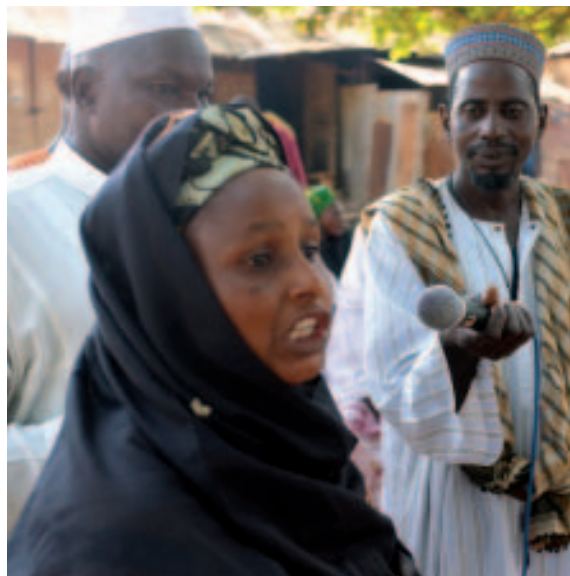
Left The participation of both men and women is critical to improvements in education for all children.