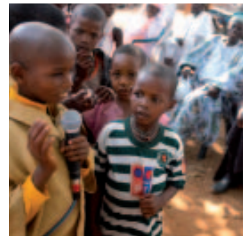
Above Children know well the factors affecting their education.

There was a lack of clarity as to the role of the local government education authorities (LGEAs) in supporting SBMCs, and the variety of training programmes offered by different organisations to SBMC stakeholders was not aiding cohesion 3 .