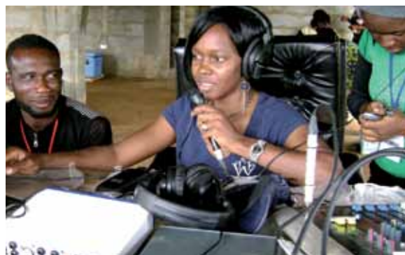
Right ESSPIN’s communications work has benefited from the expertise of some of Nigeria’s finest media practitioners.

The resources required to produce good quality communications materials is not always understood. More is involved behind the scenes than turning up with a camera, a microphone, a group of actors or a journalist’s notepad.