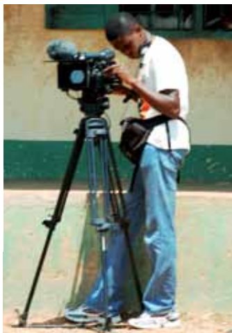
Left and below ESSPIN film-makers showed it as it is in Nigeria's schools and allowed state governments to outline their reform agenda. Schools and communities provided video testimony of the progress being made.

The production process started with desk research by the production company, Straightline Films, and briefings with ESSPIN communications and other technical staff. Preliminary visits to meet ESSPIN's state teams and education stakeholders determined key themes for each state, individuals to be interviewed and locations for filming. A draft shooting script was prepared and a pre-production report covering the proposed themes was shared with the state stakeholders before filming began.