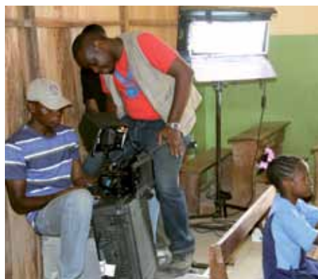
Left Film provides a powerful tool for advocacy and political engagement.

Learning from BSBN, the now six ESSPIN state films were 5 minutes in length, to offer greater versatility in broadcast schedules, and again available as local language translations. A 30 minute edit looked at the integrated approach to school improvement across the states. Both short and long films were broadcast on national TV stations (notably including morning and evening on Independence Day 2012) and made available to programme partners on DVD.