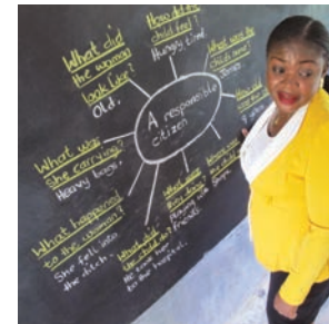
'What did the child do?', 'What did the woman say?'