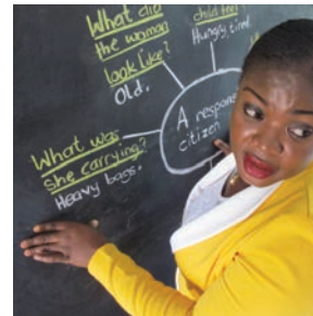
'What did the woman look like?', 'What was she carrying?'