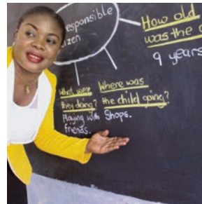
'Where was the child going?', 'What were they doing?'