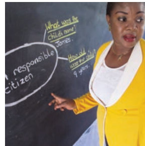
Ask: 'What was the child's name?', 'How did the child feel?'