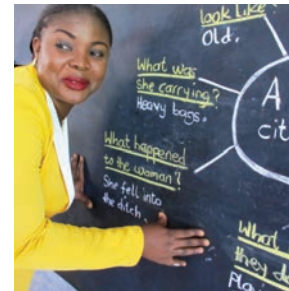
'What happened to the woman?'