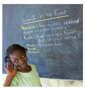
Role play the children hearing strange noises and write their speech.