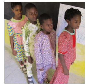
Ask the groups to role play walking along the path through the forest.