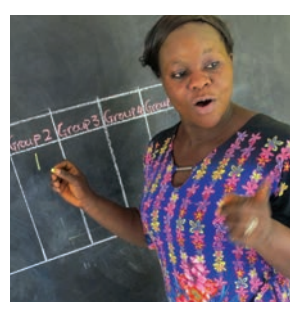
Give a point to the group holding the first correct prefix.