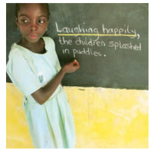
Repeat this process with the other sentences.