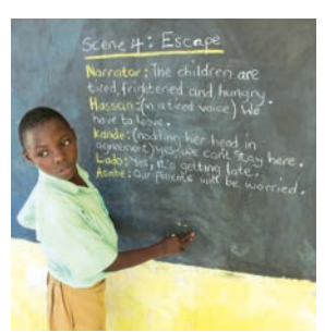
'What do the children say?' 'Why do they decide to leave?'