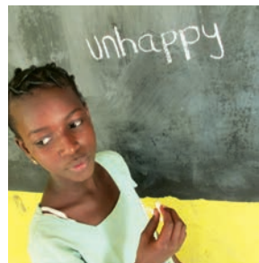
Give another point if they can write the new word on the chalkboard.