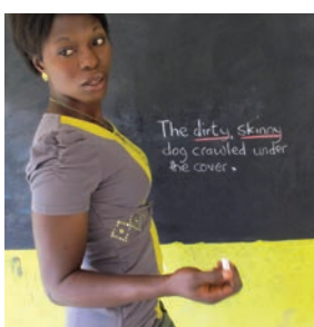
Repeat with the other sentences.

Enugu-P5-Lit-w16-20-aw√.indd 12 2/9/16 3:58 PM