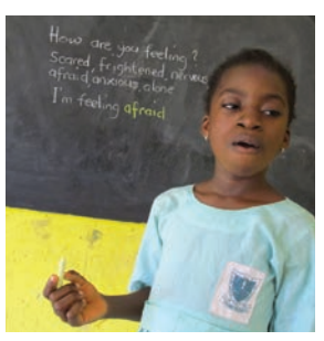
Ask each of the other pupils to complete one of these sentences: 'I feel...'