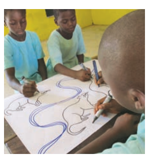
'What happened to the rats?'