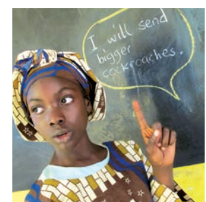
Ask, 'What did the wise woman threaten to do?'.