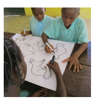
'What was the problem when the rain came?'