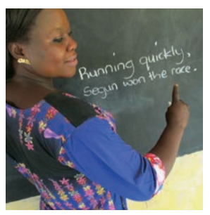
Explain that the comma separates the extra information from the rest of the sentence.