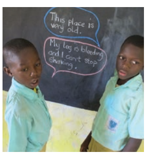
Choose other pupils to think of more things that the boys might say.