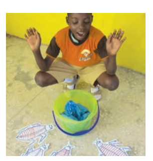
Ask the groups to role play finding cockroaches in other places.