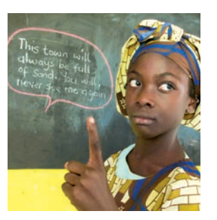
Ask the pupils to write speech for, and role play, the endings.

Enugu-P5-Lit-w16-20-aw√.indd 28 2/9/16 3:59 PM