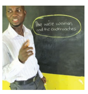
Ask, 'What shall we call our folk tale?'