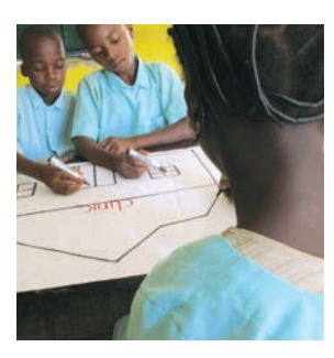
'What did Umeh want the money for?'

Enugu-P5-Lit-w16-20-aw√.indd 16 2/9/16 3:59 PM