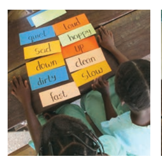
Continue until all the cards are used up.