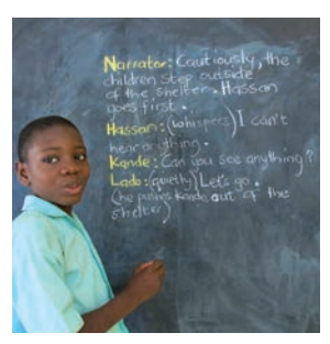
'What do the children do and say when they are back in the forest?'