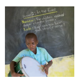
Write the beginning of scene 2 and choose some pupils to bang the drum.