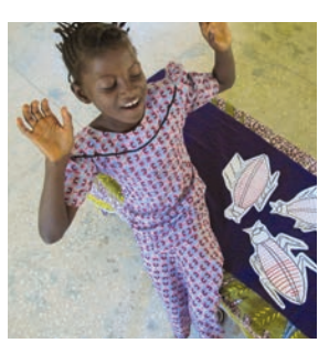
Ask the groups to role play waking up and finding cockroaches in their homes.