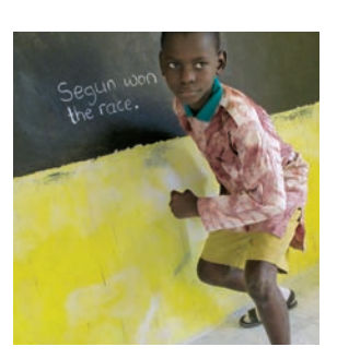
Ask the groups to role play the first sentence.