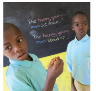
Tell some pairs to change the verb and the preposition.