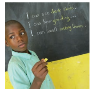
'I can see...' 'I can hear...' 'I can smell...'