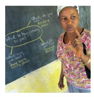
Write some of their ideas in a brainstorm.

Enugu-P5-Lit-w16-20-aw√.indd 64 2/9/16 4:01 PM