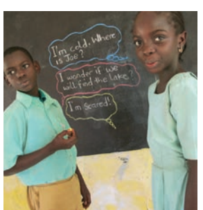
Ask the groups to write their ideas in the thought bubbles.