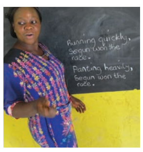
Ask, 'How did she do this?' and write their ideas on the chalkboard.