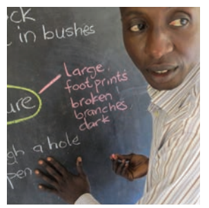
What did the boys see when they went outside?