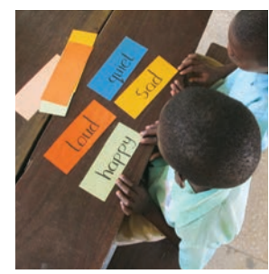
If the words are opposite, the pupil keeps the cards.