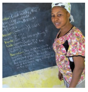
'What happens to the children at the end?'