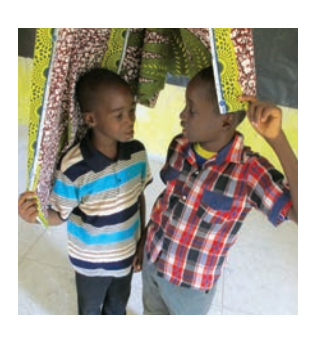
Ask the pairs to role play the boys talking inside the shelter.