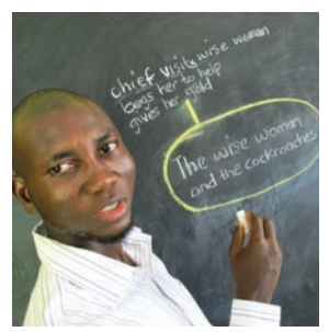
Role play what the people decided to do about the cockroaches.