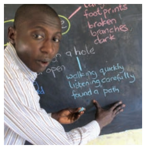
How did the boys get home?