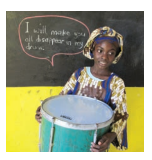
Role play ideas for a challenge facing the wise woman, eg: not getting paid.