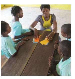
Shuffle the opposite word cards and place them face down in front of each group.