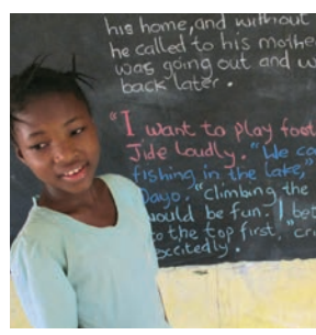
climbing the rocks.

Enugu-P5-Lit-w16-20-aw√.indd 48 2/9/16 4:00 PM