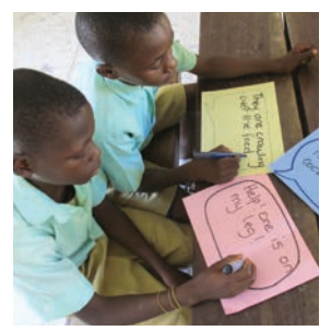
Ask the groups to write speech for the people in the speech bubbles.