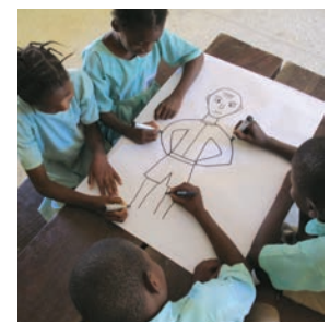
'Why did Umeh play the flute for the children?'