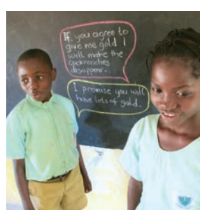
Ask the groups to complete speech bubbles for the wise woman and the chief.