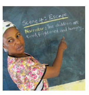
Ask the groups: 'What does the narrator say is happening in the shelter?'