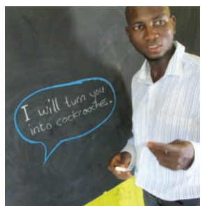
Write speech for the wise woman and the chief on the chalkboard.