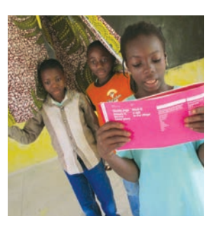
Ask the narrator to explain the setting and how the children get into the shelter.