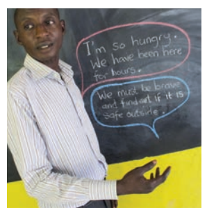
Write some of their speech on the chalkboard.