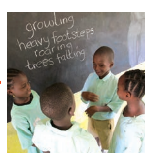
Ask the groups to describe the sounds the boys might hear next.