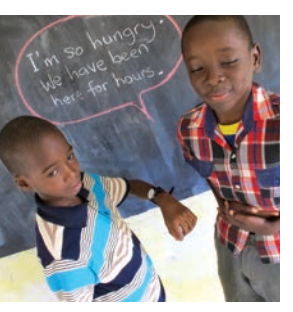
Ask the pairs to role play the boys talking about leaving the shelter.