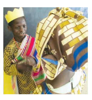
Ask the groups to role play the wise woman talking to the chief.