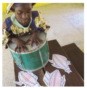
Ask the groups to role play the wise woman getting rid of the cockroaches.