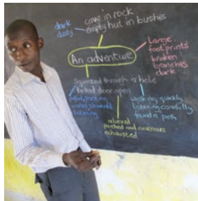
How did the boys feel when they got home?

Enugu-P5-Lit-w16-20-aw√.indd 52 2/9/16 4:00 PM