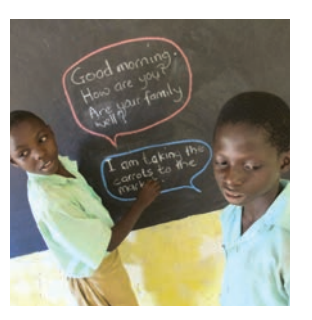
Ask the groups to write speech in the speech bubbles for the people.

Enugu-P5-Lit-w16-20-aw√.indd 20 2/9/16 3:59 PM