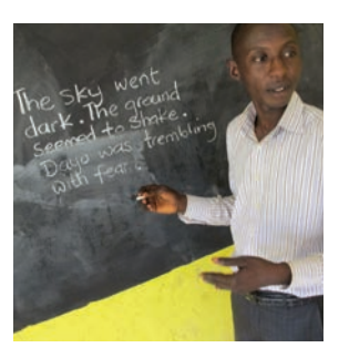
Ask the groups to help you write sentences about what the boys saw and felt.