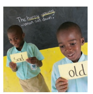
Ask some pairs to change the adjectives to make them mean the opposite.