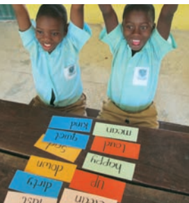
The winner is the pupil with the most cards.

Enugu-P5-Lit-w16-20-aw√.indd 8 2/9/16 3:58 PM