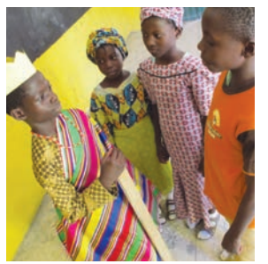
Ask them to role play the meeting with the chief.