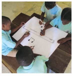
'What did Umeh bring to the village with him?'