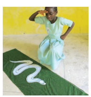
Ask them to role play, 'Bravely, Lola looked for snakes.'