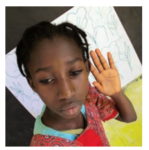
the climax when the lake speaks,