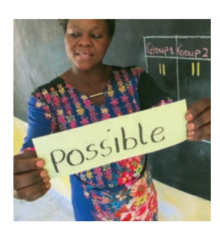
Repeat with the rest of the root words. The group with the most points wins.

Enugu-P5-Lit-w16-20-aw√.indd 42 2/9/16 4:00 PM