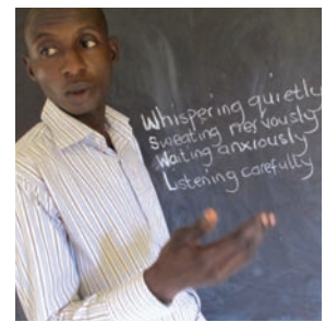
Ask the pupils to say some adjectival phrases to describe the boys in the shelter.

Enugu-P5-Lit-w16-20-aw√.indd 54 2/9/16 4:00 PM