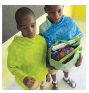
Role play the two men travelling to Umeh's town.