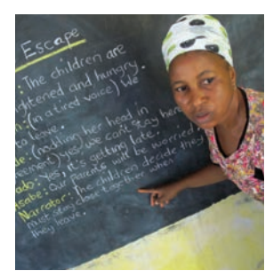
'How do they leave the shelter?'