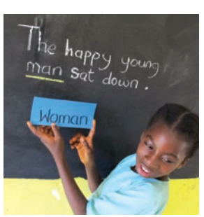
Choose some pairs to change the noun.