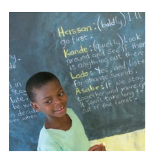
'What are they worried about?'

Enugu-P5-Lit-w16-20-aw√.indd 66 2/9/16 4:01 PM