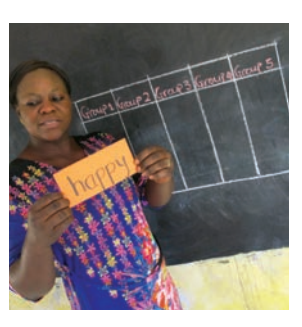
Read the first root word.