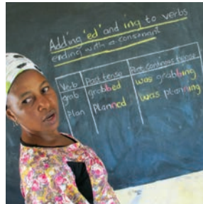
verbs ending in a consonant after a short vowel sound, double the consonant.

Enugu-P5-Lit-w16-20-aw√.indd 60 2/9/16 4:01 PM