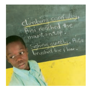
Write the new sentences and underline the adjectival phrases.

Enugu-P5-Lit-w16-20-aw√.indd 38 2/9/16 3:59 PM