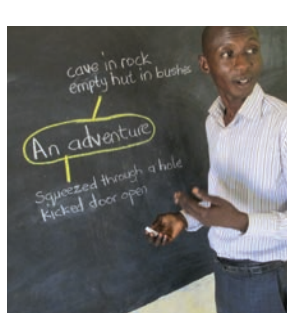
Where did the boys find a shelter? How did they get in?