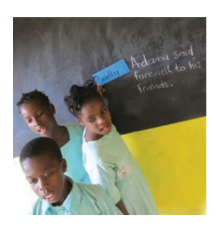
Ask each group to choose an adverb opener for a sentence.