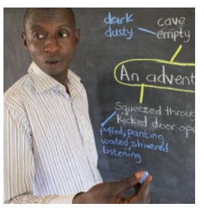
What was it like inside the shelter? What did the boys do?