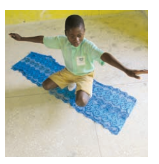
Ask them to role play, 'Proudly, the bird flew into the water.'

Enugu-P5-Lit-w16-20-aw√.indd 34 2/9/16 3:59 PM