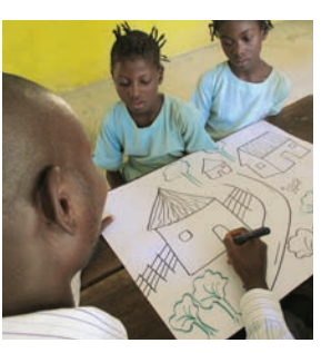
Ask the pupils to help you to draw the setting for the folk tale.