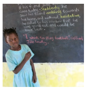
Add their ideas to the writing frame, eg: playing football,