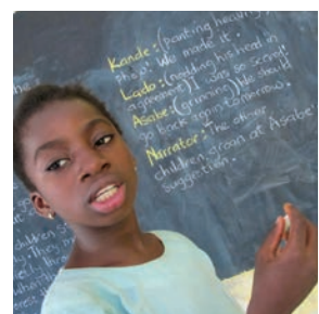
'What do the children say and do at the end of the playscript?'

Enugu-P5-Lit-w16-20-aw/.indd 68 2/9/16 4:01 PM