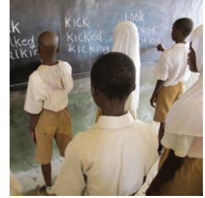
The third pupil writes the verb with 'ing'. Continue for 3 minutes using different verbs.