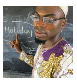
Tell the pupils to read out the ideas on their brainstorm sheet.