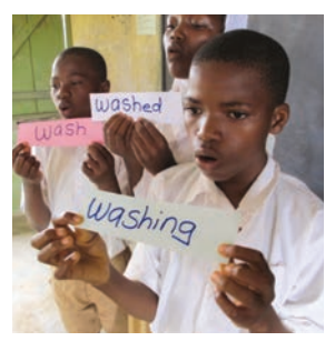
Ask the pupils to find their 'friends' with the word with the added suffix.