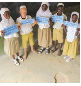
Choose five pupils to come and hold a sentence card each.