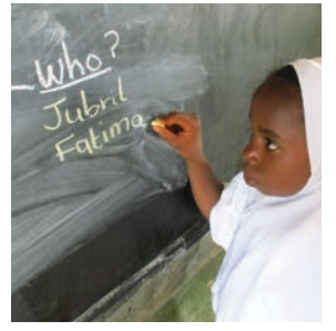
Who? Ask the pupils to suggest some children's names, eg: Jubril, Fatima.