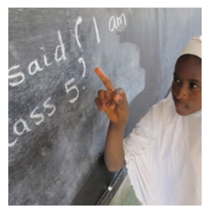
Choose a pupil to put in the missing speech marks. Ask what else is missing.