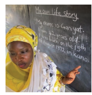
Use the brainstorm to build detail: Where?, When?