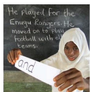
In pairs, ask the pupils to join the two sentences using 'because', 'but' or 'and'.