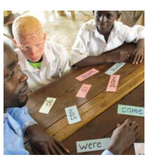
Give the flash cards to the pupils.