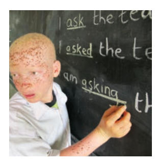
Ask the pupils to put the new words into sentences.