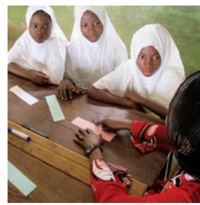
Give each group of three a set of blank flash cards.