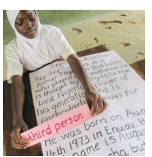
Paragraphs are in the third person.