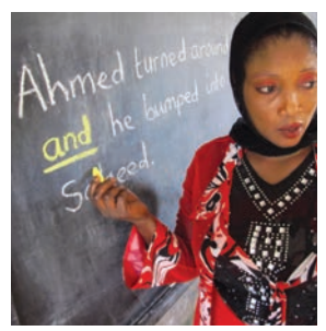
We use 'and' to join two simple sentences and make a longer sentence.