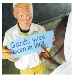
Choose some pupils to say which sentence should be at the beginning.