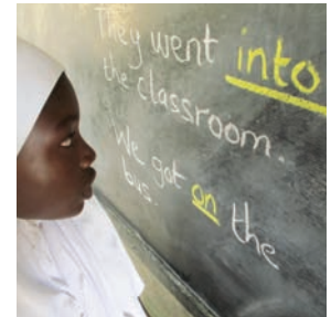
Ask some pupils to say these sentences using 'into' and 'on'.