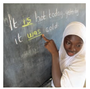
Choose some pupils to say a sentence using their verb and the other form of the same verb.