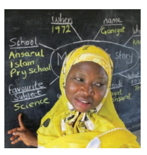
Remind the pupils about the information from the brainstorm yesterday.