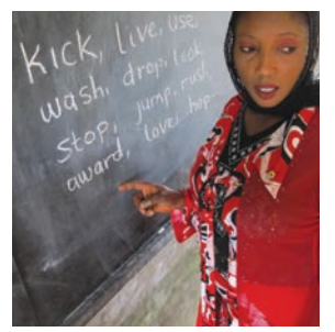
Look at the verbs on the chalkboard.