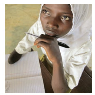
Tell them to write four more sentences based on the brainstorm ideas.