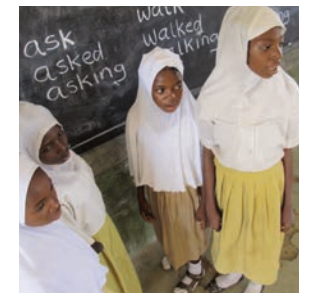
Each group should say the words they have written on the chalkboard.