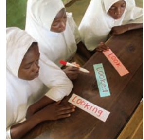
Ask the groups to choose one verb and write one version of it on each card.