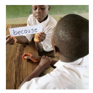
Hand out the 'but' 'because' and 'and' cards for pupils to hold up and show the conjunction used.