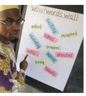
Wow! words make writing interesting.