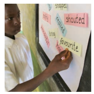
Encourage pupils to think of their own wow! words and add them to the wow! words wall.