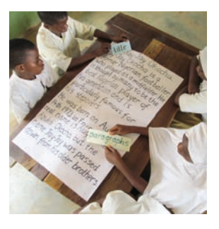
A biography tells the story of a person's written mainly life. It must have a title and be written in paragraphs.