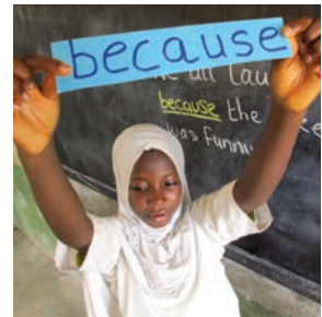
We use 'because' to explain more and make text interesting.