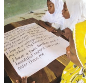
Who is in your family? What are their names?