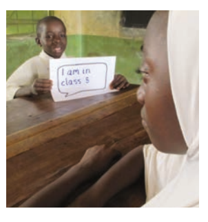
Choose a pupil to hold up one of the speech bubbles and read it.