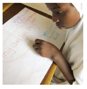
What do I look like? What sort of person am I?