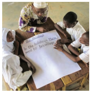
Explain that it will be in the third person. Write the first sentence.