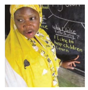
Use the brainstorm to think about: Why do I like to teach?