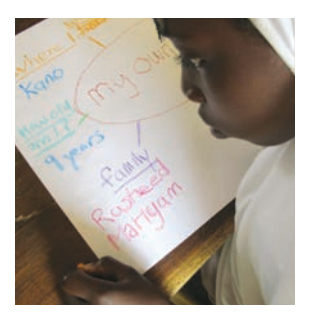
Who is in my family? What are their names? How old are they?