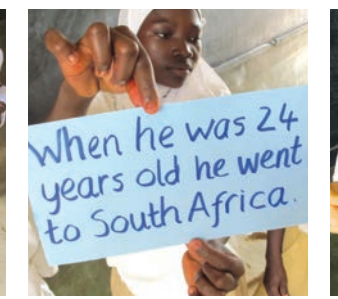
Make sure that everyone can read them.