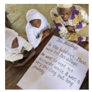
Write the end of the sentence with one of their ideas. Repeat this process for each sentence.