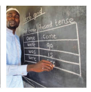
Show the pupils how to put the verbs into a verb grid.