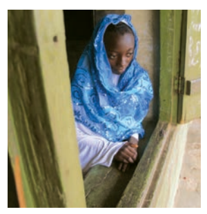
The second paragraph explains the next event: Safiya could not sleep.