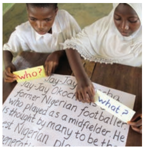
The first paragraph answers the questions: Who?, What?, When?, Where? and How?