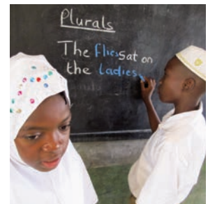
While they do this, their partner should change the highlighted words to plurals.