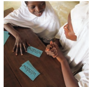
Play the snap game with the new word/phrase cards.