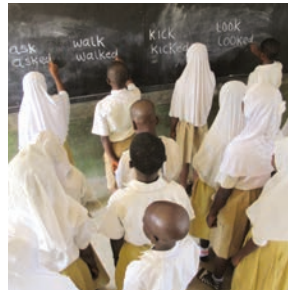
The second pupil should write the verb with the 'ed' suffix.