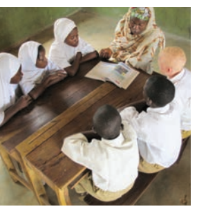
Do guided reading with the group.