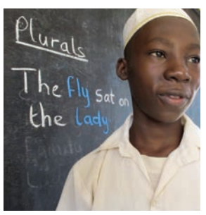
Tell one member of each pair to read the sentence.