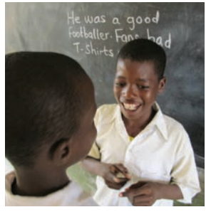
Tell the pupils to say the sentences to their partner.