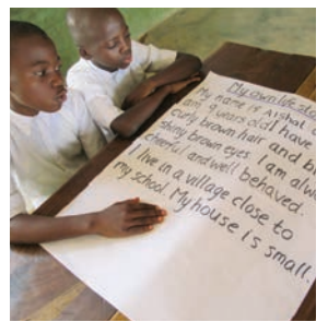
Where do you live? What is your home like?