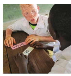
Ask them to find their matching verb.