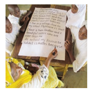
Who are your friends? What games do you play?