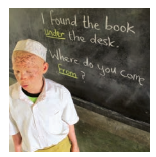
Ask other pupils to say these sentences using 'under' and 'from'.