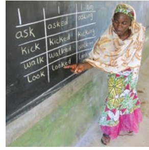
For verbs with two vowels before the consonant the suffix is just added.