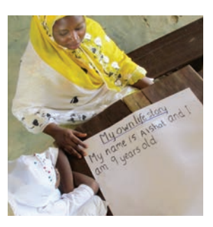
What is your name? How old are you?