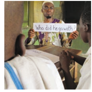
Use questions to prompt the pupils' thinking.