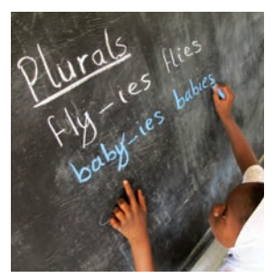
We drop the 'y' and add 'ies' with plural words ending with a consonant and 'y'.