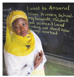
Use the brainstorm to build detail: Where did I go to school? What were my favourite subjects?