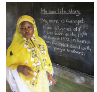
Use the brainstorm to add detail: How many sisters and brothers?