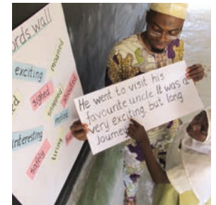
Display examples of wow! words so the pupils can see and use them in their writing.