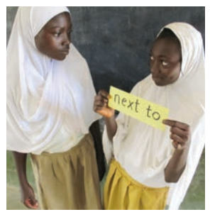
Tell the pupils to stand 'next to' a friend.