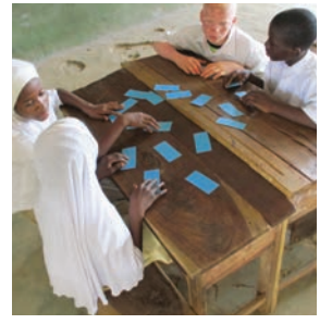
Play the matching game with the new word/phrase cards.