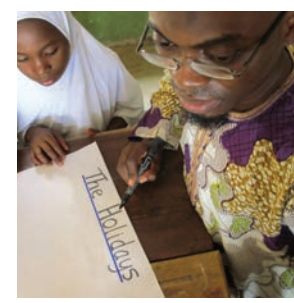
Ask the pupils to help you write a recount called 'The holidays'.