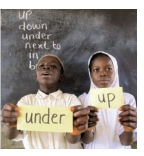
Ask pupils to hold up the preposition flash cards that show position.