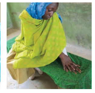
Recounts mainly use the past tense: Safiya went back to bed.