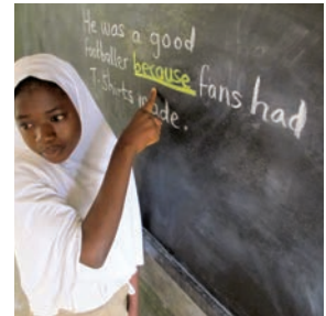
Write their answers on the chalkboard and ask the pupils to read them.