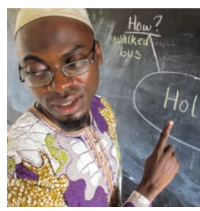
How? Ask the pupils how they travelled, eg: bus, walked.