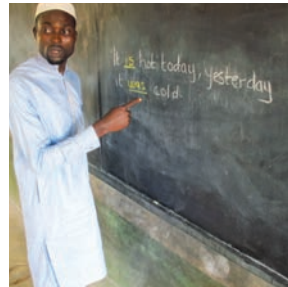
Each time, ask: 'Does that sound right?', 'When did it happen?'