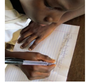
Tell them to write the first sentence.