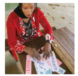
Collect the flash cards to use again tomorrow.