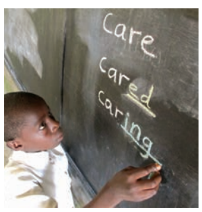
For verbs ending with 'e', we drop the 'e' before adding 'ed' or 'ing'.