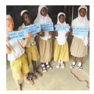
Ask, 'What happens next?' and repeat moving the cards in order.