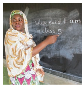
Write the name of the pupil on the chalkboard and what he or she said.