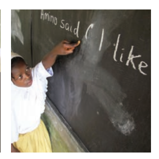
Choose other pupils to put in the missing speech marks.