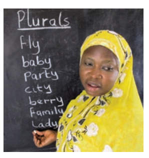
Write these words on the chalkboard.