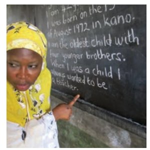
Use the brainstorm to add more detail: What were my dreams?