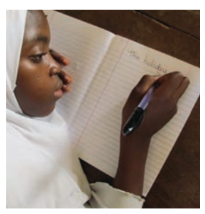
Tell them to write 'The holidays' in their exercise books.