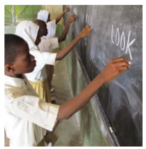
The first pupil in each team should write a verb on the chalkboard.