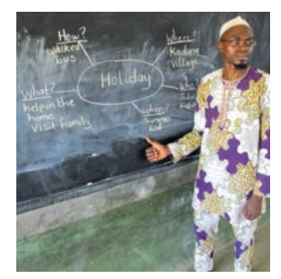
When? Ask what happens on the first morning of school, eg: get up early, pack the school bag.