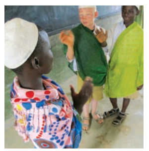
When he was his family to work in South Africa.