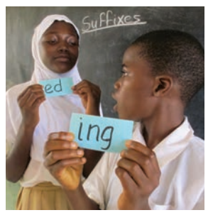
Ask pupils if they can say the rules for adding 'ed' and 'ing' suffixes to a word.