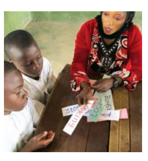
Shuffle the verb cards that the pupils made yesterday and give each pupil one.