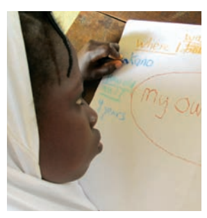
Where was I born? How old am I?