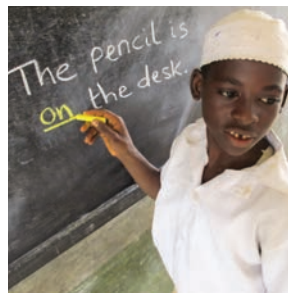
Ask the pupils to complete a sentence using a preposition.