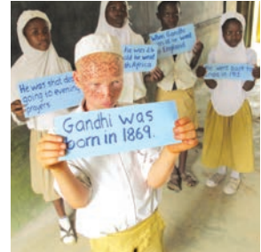
Ask the pupil holding that card to stand before the others.