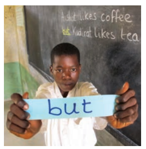
We use 'but' to show a difference.