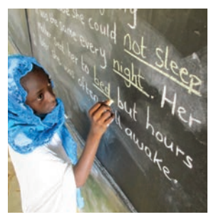
Check that you have included Who?, When?, What?, Where? and How? in the recount.