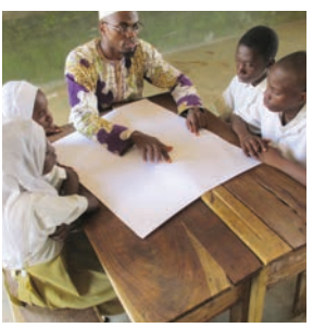
Have ready a large piece of paper or use the chalkboard.