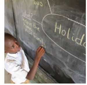
What? Ask the pupils what children do in the holidays, eg: help in the home, visit family.