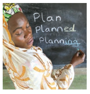
For one syllable verbs with one vowel before the consonant, we double the consonant.