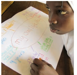
What is my home like? Where do I go to school?