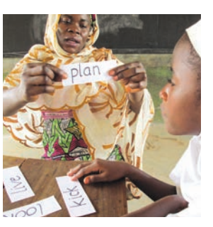
Say the verbs.