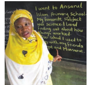
Use the brainstorm to think about more detail: What games did we play?