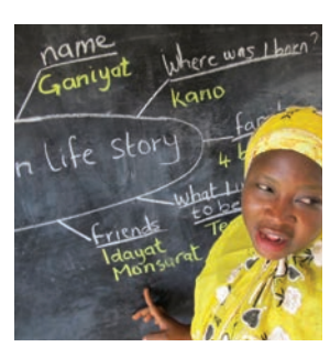
Tell the pupils about yourself and make some notes on the chalkboard.