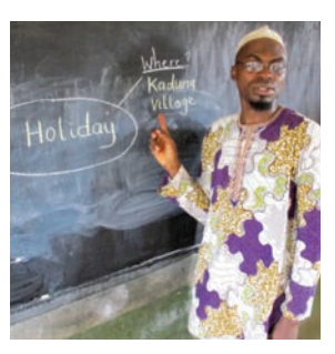
Where? Ask the pupils to name some places children go in the holidays, eg: Kaduna, the village.