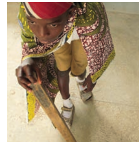
Father waiting at the gate.