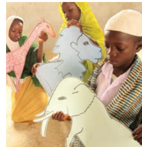
Walking on the beach or going to the zoo.