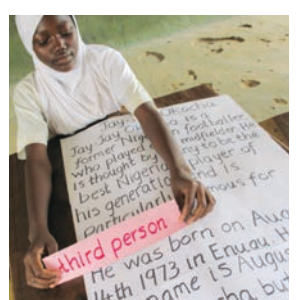
Paragraphs are in the third person.