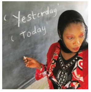
Write 'Yesterday' and 'Today' on the chalkboard.