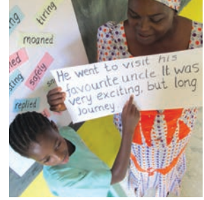
Display examples of wow! words so the pupils can see and use them in their writing.