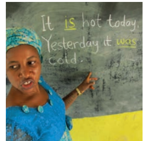
Each time, ask: 'Does that sound right?', 'When did it happen?'