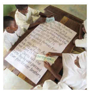
A biography tells the story of a person's written mainly life. It must have a title and be written in paragraphs.