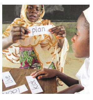
Say the verbs.