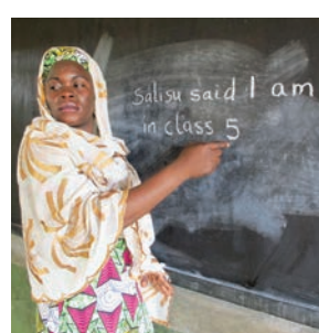
Write the name of the pupil on the chalkboard and what he or she said.