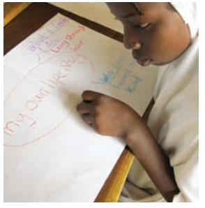
What do I look like? What sort of person am I?