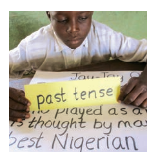
A biography is written in the past tense.

Kwara-P5-Lit-w1-5-aw indd 42 11/12/16 11:00 AM