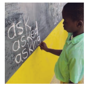
Each group should say the words they have written on the chalkboard.