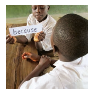
Hand out the 'but' 'because' and 'and' cards for pupils to hold up and show the conjunction used.