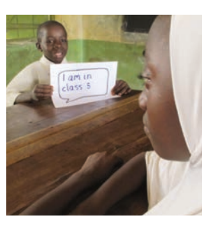
Choose a pupil to hold up one of the speech bubbles and read it.