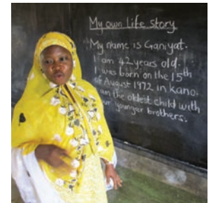
Use the brainstorm to add detail: How many sisters and brothers?