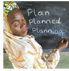
For one syllable verbs with one vowel before the consonant, we double the consonant.