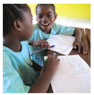
Tell them to discuss how to begin writing.