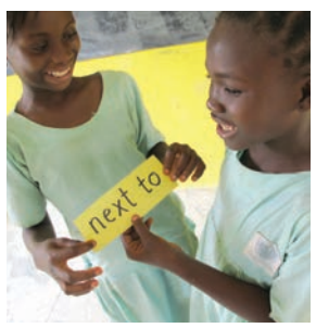
Tell the pupils to stand 'next to' a friend.