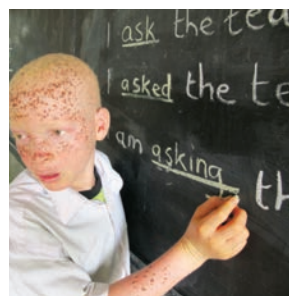
Ask the pupils to put the new words into sentences.