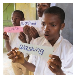
Ask the pupils to find their 'friends' with the word with the added suffix.