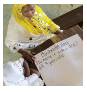
What is your name? How old are you?