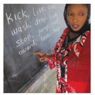
Look at the verbs on the chalkboard.