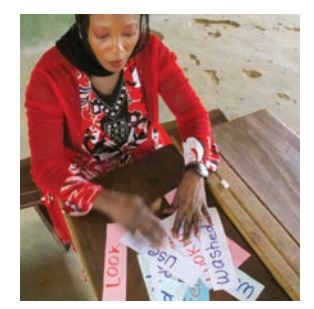
Collect the flash cards to use again tomorrow.

Kwara-P5-Lit-w1-5-aw.indd 38 11/12/16 10:59 AM