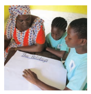
Ask the pupils to help you write a recount called 'The holidays'.