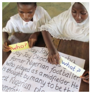
The first paragraph answers the questions: Who?, What?, When?, Where? and How?