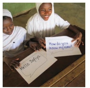
Write the speech between Safiya and the voice. Read it to the group.