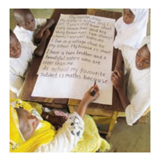
Who are your friends? What games do you play?