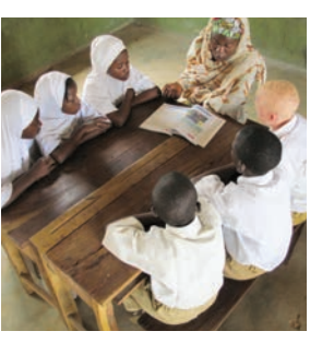
Do guided reading with the group.