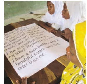
Who is in your family? What are their names?