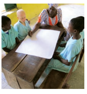
Have ready a large piece of paper or use the chalkboard.