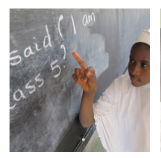
Choose a pupil to put in the missing speech marks. Ask what else is missing.