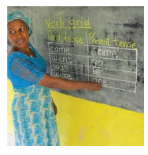
Show the pupils how to put the verbs into a verb grid.