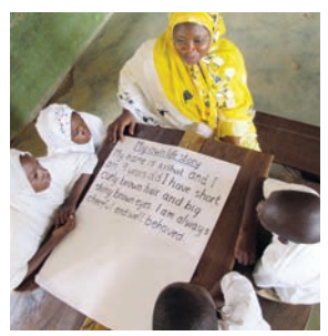
What do you look like? What sort of person are you?