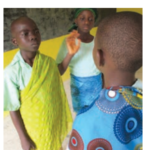
When he was 24 he went with his family to work in South Africa.