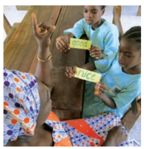
Words like 'good', 'nice', and 'said' are often over-used and can make writing dull.