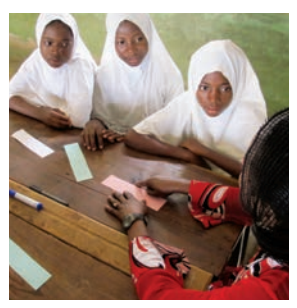
Give each group of three a set of blank flash cards.