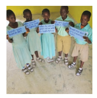
Ask, 'What happens next?' and repeat moving the cards in order.