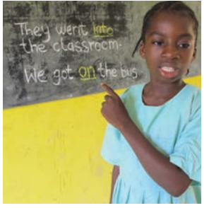
Ask some pupils to say these sentences using 'into' and 'on'.