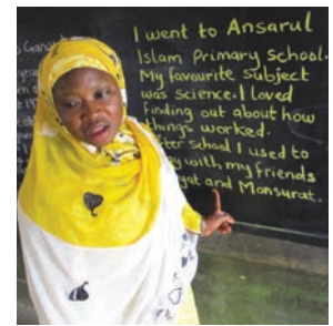
Use the brainstorm to think about more detail: What games did we play?