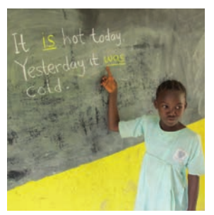
Choose some pupils to say a sentence using their verb and the other form of the same verb.