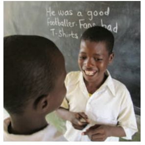
Tell the pupils to say the sentences to their partner.