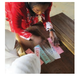
Collect the flash cards to use again tomorrow.