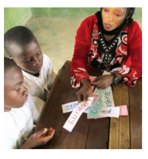
Shuffle the verb cards that the pupils made yesterday and give each pupil one.