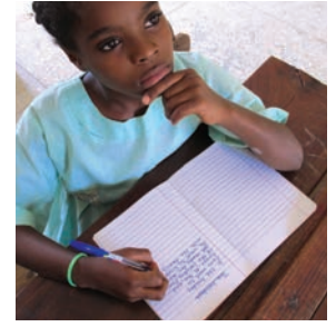
Tell them to write four more sentences based on the brainstorm ideas.