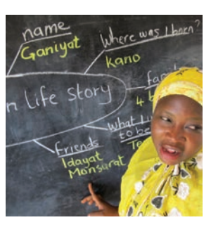
Tell the pupils about yourself and make some notes on the chalkboard.