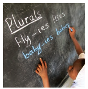
We drop the 'y' and add 'ies' with plural words ending with a consonant and 'y'.