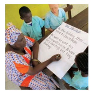
Write the end of the sentence with one of their ideas. Repeat this process for each sentence.