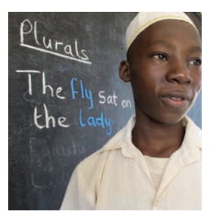
Tell one member of each pair to read the sentence.