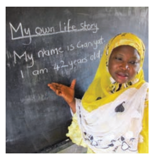
Use the brainstorm to begin writing the introduction: Who?