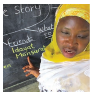
Use the brainstorm to add detail: Who were my friends?