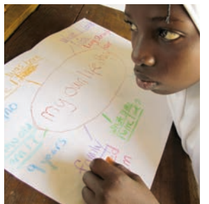
What is my home like? Where do I go to school?