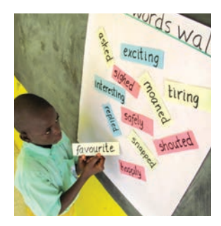
Encourage pupils to think of their own wow! words and add them to the wow! words wall.