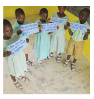
Choose five pupils to come and hold a sentence card each.