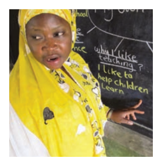
Use the brainstorm to think about: Why do I like to teach?