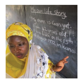
Use the brainstorm to build detail: Where?, When?