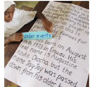
The events in the person's life must be written in the correct order.