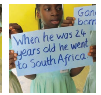
Make sure that everyone can read them.