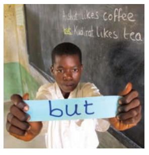
We use 'but' to show a difference.