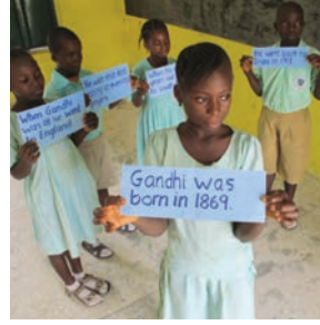
Ask the pupil holding that card to stand before the others.