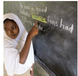
Write their answers on the chalkboard and ask the pupils to read them.