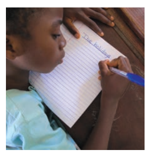
Tell them to write 'The holidays' in their exercise books.