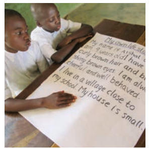
Where do you live? What is your home like?