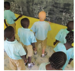
The third pupil writes the verb with 'ing'. Continue for 3 minutes using different verbs.