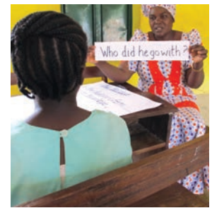
Use questions to prompt the pupils' thinking.