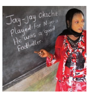
Read the first two sentences to the class.