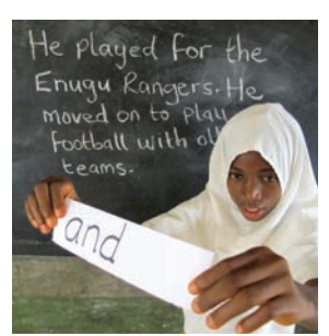
In pairs, ask the pupils to join the two sentences using 'because', 'but' or 'and'.