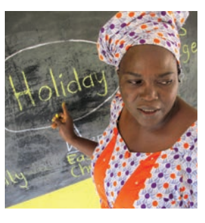
Tell the pupils to read out the ideas on their brainstorm sheet.