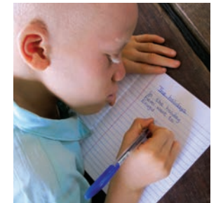
Tell them to write the first sentence.