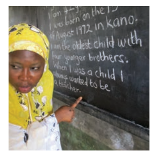
Use the brainstorm to add more detail: What were my dreams?