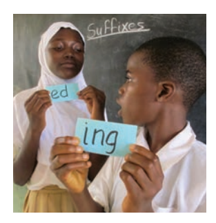
Ask pupils if they can say the rules for adding 'ed' and 'ing' suffixes to a word.