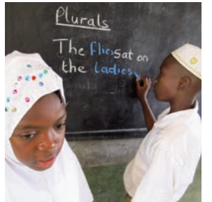
While they do this, their partner should change the highlighted words to plurals.