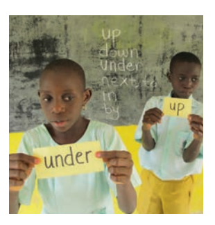
Ask pupils to hold up the preposition flash cards that show position.