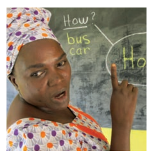
How? Ask the pupils how they travelled, eg: bus, walked.