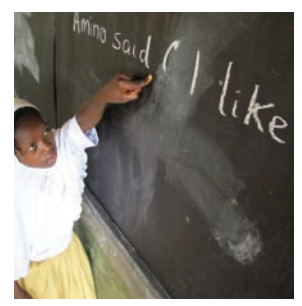
Choose other pupils to put in the missing speech marks.