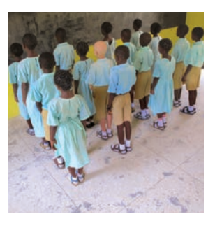
Divide the class into equal teams and line them up in front of the chalkboard.