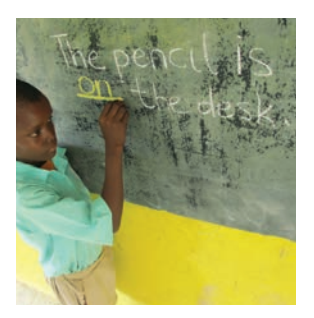
Ask the pupils to complete a sentence using a preposition.