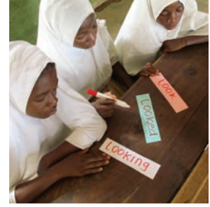
Ask the groups to choose one verb and write one version of it on each card.