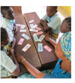
Give the flash cards to the pupils.