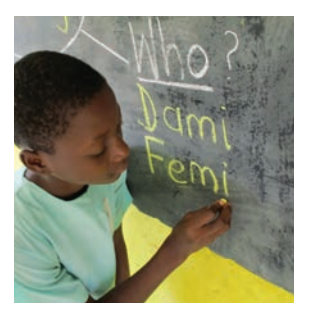
Who? Ask the pupils to suggest some children's names, eg: Dami, Femi.