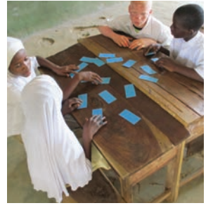
Play the matching game with the new word/phrase cards.