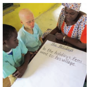
Explain that it will be in the third person. Write the first sentence.