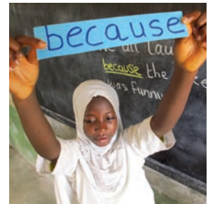
We use 'because' to explain more and make text interesting.