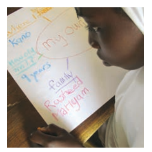
Who is in my family? What are their names? How old are they?