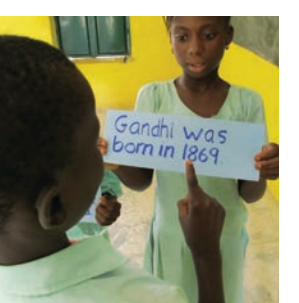
Choose some pupils to say which sentence should be at the beginning.