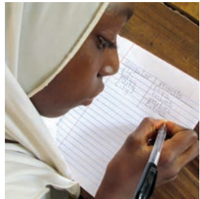
Tell the pupils to write the singular and plural words in their exercise books.