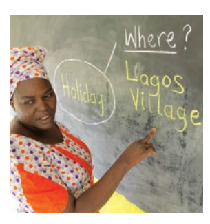
Where? Ask the pupils to name some places children go in the holidays, eg: Lagos, the village.