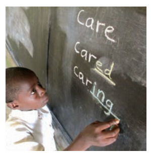
For verbs ending with 'e', we drop the 'e' before adding 'ed' or 'ing'.