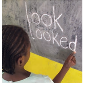
The second pupil should write the verb with the 'ed' suffix.