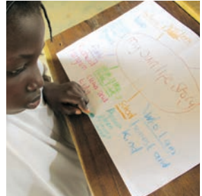
What are my best subjects? Who are my favourite teachers?