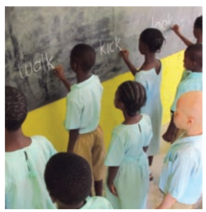
The first pupil in each team should write a verb on the chalkboard.