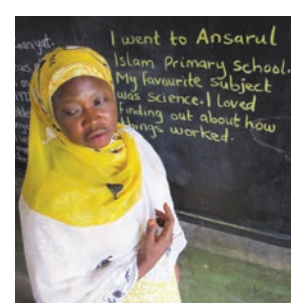
Use the brainstorm to build detail: Where did I go to school? What were my favourite subjects?