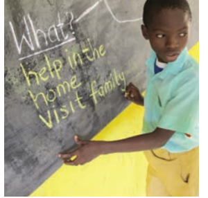
What? Ask the pupils what children do in the holidays, eg: help in the home, visit family.