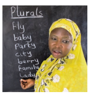
Write these words on the chalkboard.