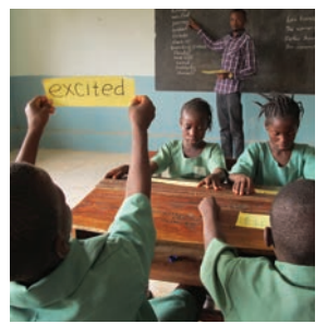
Read some of the words and ask the pupils to hold up the matching card.