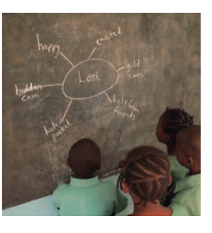
Look together at the brainstorm.