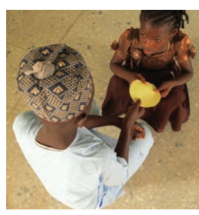
Why did he give her a gold coin?