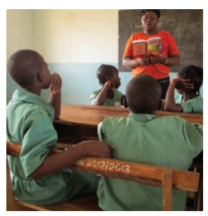
Read out the first word from the long 'i' list.