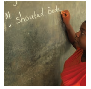
Use a word that tells you how the speech sounds.