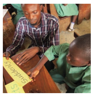
Give out the words/ phrases flash cards to the class.