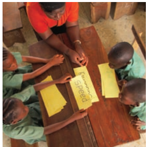
The first pupil to shout 'Snap' when a new card matches the previous one keeps all the cards.