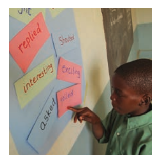
Encourage pupils to add their own words to the wow! words wall.