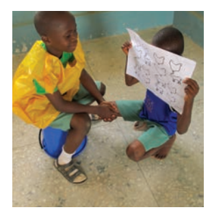
He bought more land and some chickens and goats.