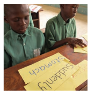
Tell the pupil to turn the cards back if they don't match.