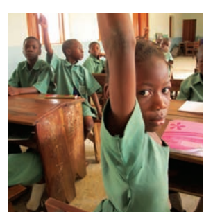
Ask the pupils questions about the topic.