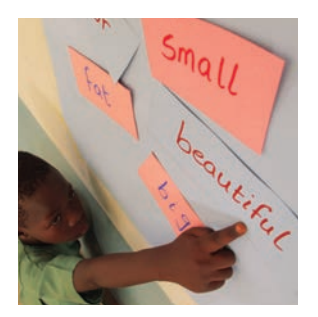
Write the adjectives on the wow! words wall.