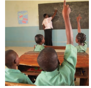
Ask the pupils questions about the topic. As they reply, write their answers around the title.