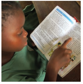
Encourage pupils to collect interesting words.