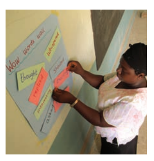
Make a wow! words wall.