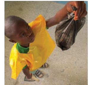
Underneath the yam, he found a bag of gold coins.