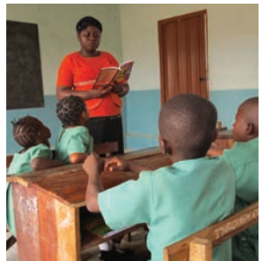
Read the recount again.