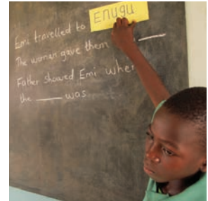
Read the missing word sentences. Ask the pupils to hold up the missing word.