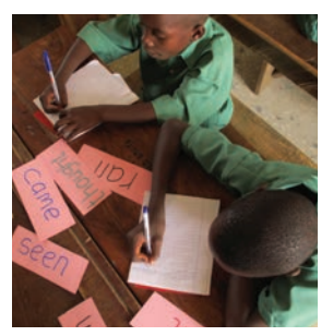
Ask them to write sentences using the irregular verb flash cards in their exercise books.