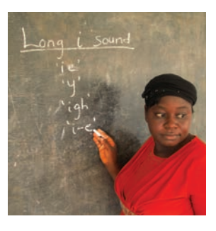
Ask the pupils to help you write some of the letters that make the long 'i' sound on the chalkboard.