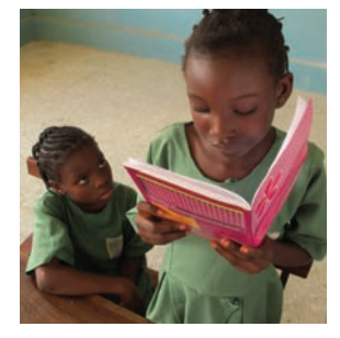
Ask each pupil to say their sentence.