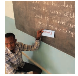
The resolution or ending describes how the problem is solved.