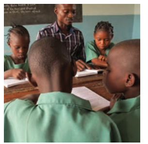
Sit down with the pupils for guided reading.