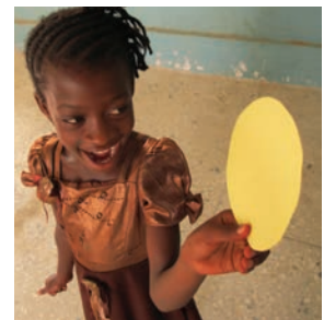
How did she feel?