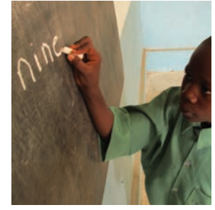
Ask the class if it is correct.