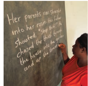
Write detailed descriptions.