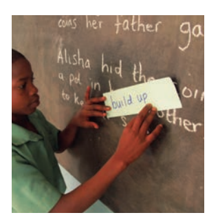
The build-up introduces the story-line and drops some clues about what may happen.