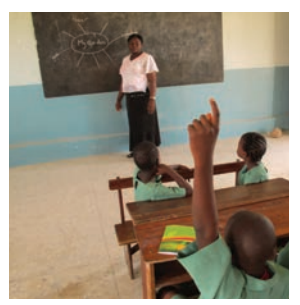
Ask the pupils questions about the topic.