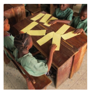
Shuffle the words/ phrases flash cards. Turn them face down on the desk.