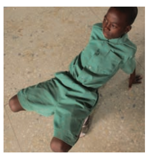
Remind pupils that the past tense means something that has happened, eg: 'He jumped'.