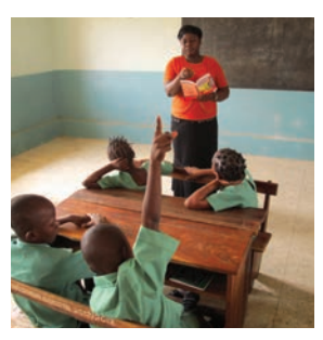
Ask them what kind of writing it is.