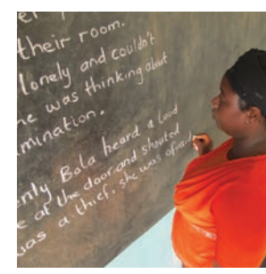
Write paragraphs in the order that events happened.