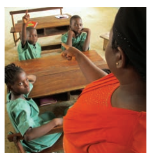
Choose someone to write the word on the chalkboard.