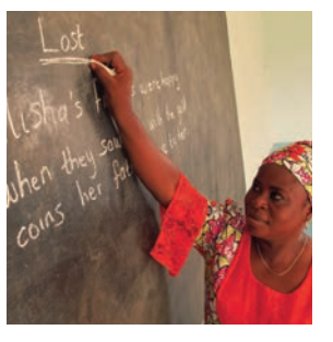
Have a clear, underlined title.