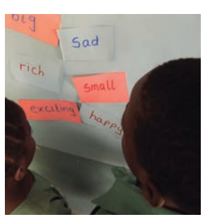
Discuss words that will make the story more interesting.