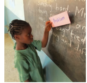
Each story should have a problem that needs to be fixed, eg: a character who is unhappy.