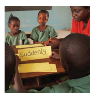
Each pupil turns over a card and places it in the middle.