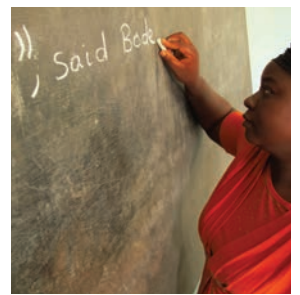
Put a comma in between the speech marks and the speaker.