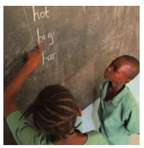
Discuss words that will make their writing more interesting.