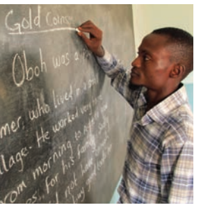
Have a clear, underlined title.