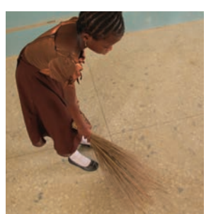
What good things had she done?