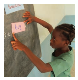
Ask the pupils to complete sentences about the topic.