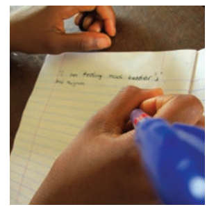
Remind the pupils to put a comma in between the speech marks and the speaker.