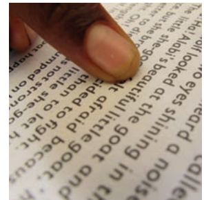
Help pupils to find adjectives in a story, eg: 'beautiful', 'old', 'good', 'kind'.