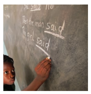
Words like 'said', 'good' and 'nice' are often over-used and can make writing dull.