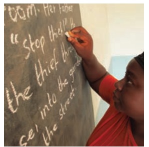
If possible, use speech.