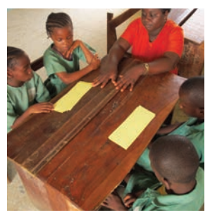
Each pupil puts their cards face down in a pile in front of them.