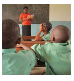
Read the recount to the pupils.