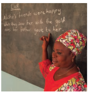
Have an introduction that sets the scene and introduces the characters.