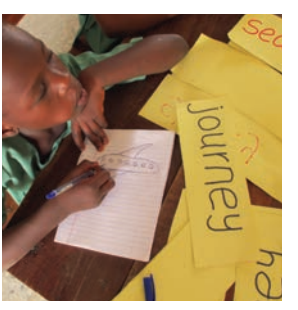
Tell the pupils to choose three words/ phrases and draw a picture of them.