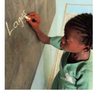
Ask the pupils to try to complete a sentence.