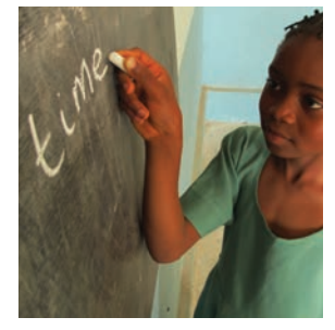
Repeat the process with the other words.