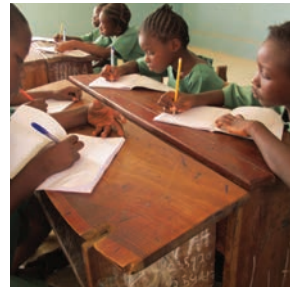
Ask the pupils to complete sentences about the topic.