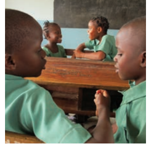
Ask the pupils to tell each other somewhere they would like to travel to.