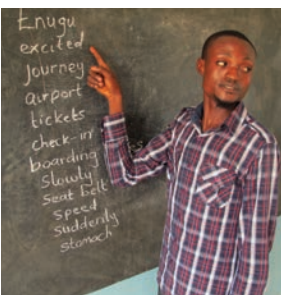
Ask the pupils to read the words/ phrases on the chalkboard.