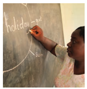
Write the title or topic in the middle of the chalkboard.