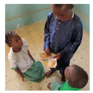
The ending: His family was never poor again.