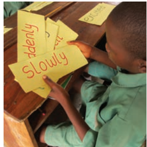
The pupil with the most cards at the end is the winner.