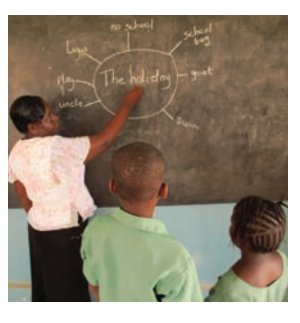
Look together at the brainstorm.