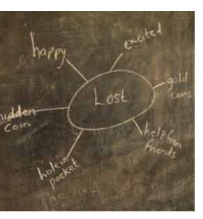
Identify a topic for pupils' writing.