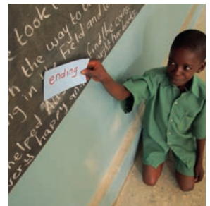
The resolution or ending or describes how the problem is solved.