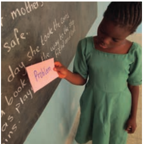
Each story should have a problem that needs to be fixed.