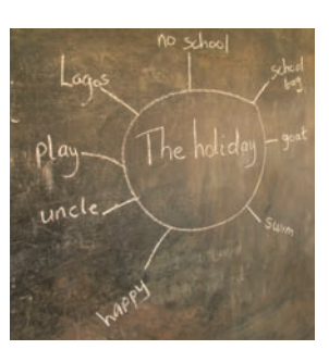
A brainstorm is when you gather ideas for writing.