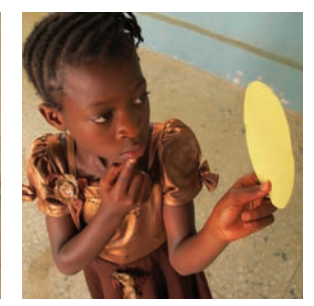
What could she buy with the gold coin?