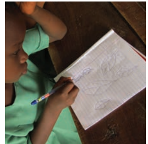
Tell them to draw a picture in their exercise books.