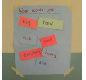
Use their ideas to create a wow! words wall.