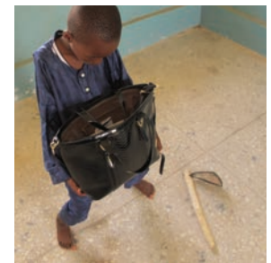
The resolution: He found a bag of gold.