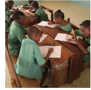
Ask the groups to try to complete a paragraph of the story.