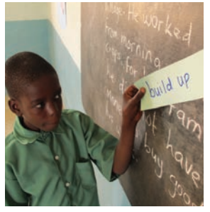
The build-up introduces the story-line and drops some clues about what may happen.