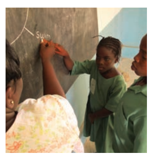
Use the ideas to complete sentences with the class.