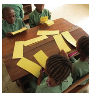
Tell each pupil in turn to pick up two cards.