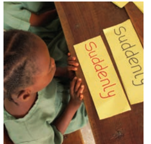
Tell the pupil to keep the cards if they match.