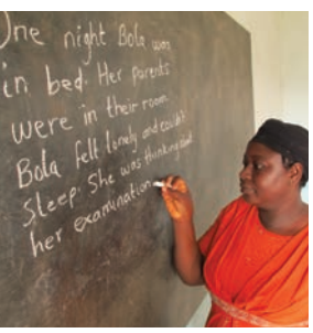
Use the past tense.