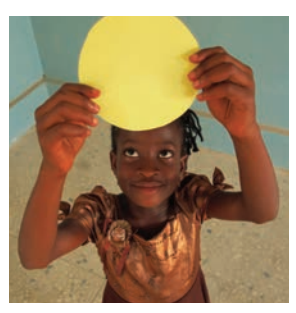
What did the gold coin look like?