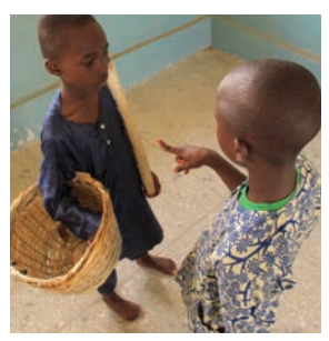
The build-up: His brother said, 'You must sell your vegetables'.