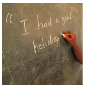
Speech marks are put around the words people actually say.