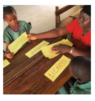
Divide the words/ phrases cards between the pupils in the group.