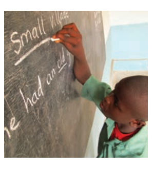
Wow! words make writing interesting.