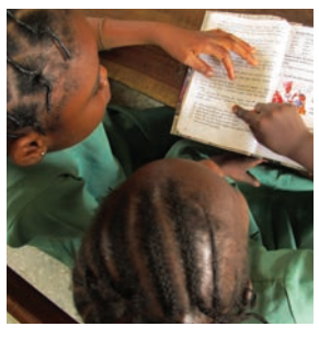
Ask the pairs to find examples of speech in the textbook.