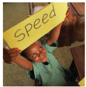
Continue until one pupil has all of the cards.