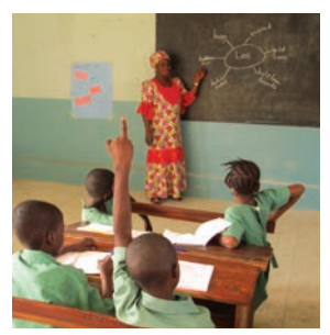
Work with the pupils to brainstorm ideas about the topic.