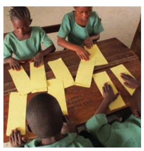
Tell the pupils to play the matching game.