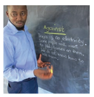
Ask the groups to discuss reasons against having computers.