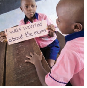
Give each group a main clause flash card and ask them to add a subordinate clause.