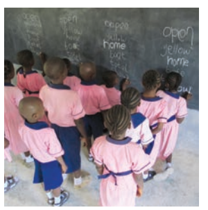
Ask the groups to check the lists are spelled correctly.