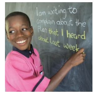
Ask, 'When did you hear about the plan?' and add a clause to the sentence.