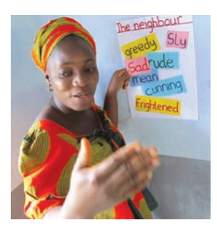
Ask the pairs to describe the neighbour and add to the character adjectives card.

Lagos-P5-Lit-w11-15-aw√.indd 48 12/10/15 10:09 AM