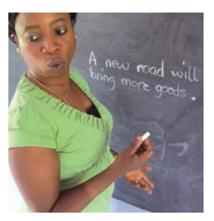
Use pupils' ideas to write a sentence for a new road.