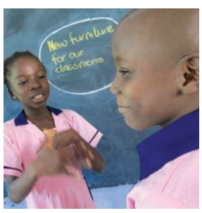
Ask the pupils to say why they need new furniture.