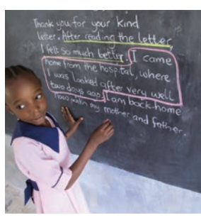
Ask another group to draw a circle around the subordinate clauses.