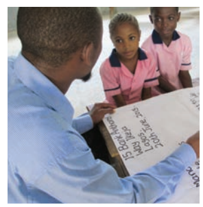
Ask them to suggest sentences with reasons for the second paragraph.

Lagos-P5-Lit-w11-15-aw√.indd 40 12/10/15 10:09 AM