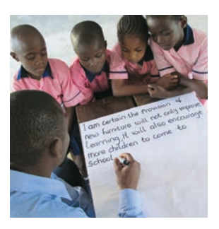
Ask the pupils to say a clear sentence to end the letter.