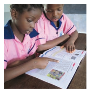
Ask each group to find some of these pronouns in the story.