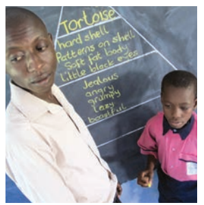
Write words to describe Tortoise's character on the next row.