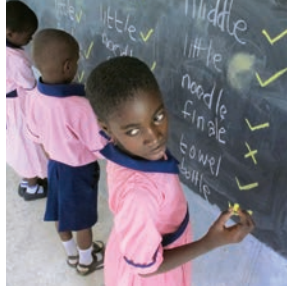
Ask the groups to check that the lists are spelled correctly.