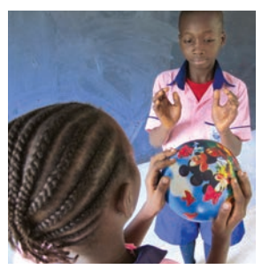
Ask the pairs to role play some of the things Rosemary does at school.