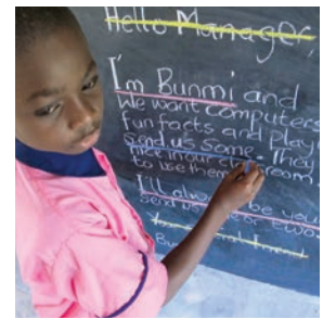
Ask the pupils, 'Is the letter polite?'