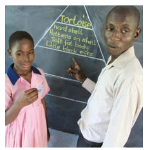
Ask the pupils to help you to describe Tortoise's appearance on the next row.