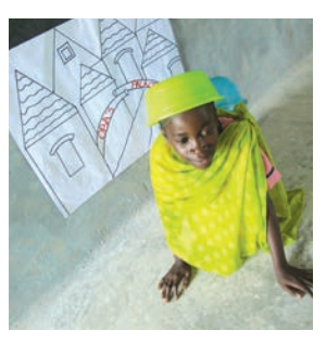
Choose some pupils to role play: Tortoise at the palace,