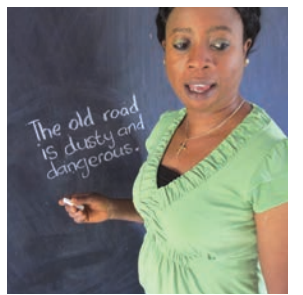
Use pupils' ideas to write a sentence against a new road.