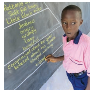
Ask the pupils to say some of the things Tortoise did for the final row.