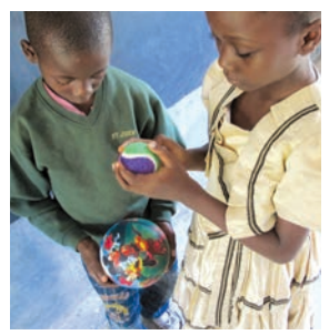
Choose some pupils to role play what might happen if the road is built: