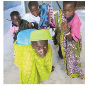
the fierce warriors, and Tortoise running to the riverbank.