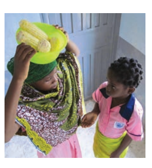
Ask the pairs to role play: Amina asking for corn,