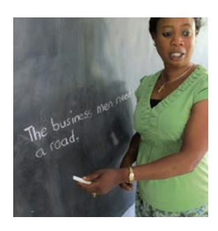
Write, 'The business men need a new road.' on the chalkboard