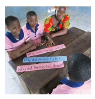
Give each group different questions and ask them to role play the answers: