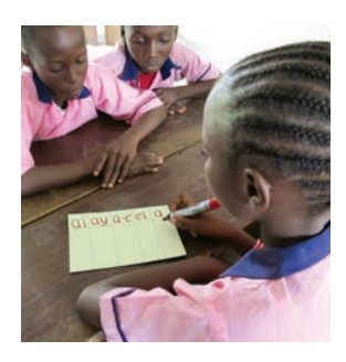
Ask the groups to write the different long 'a' spellings on a chart on their paper.