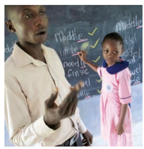
Ask the groups to underline the 'le' words.

Lagos-P5-Lit-w11-15-aw√indd 68 12/10/15 10:10 AM