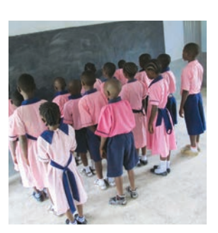
Tell each group to make a line in front of the chalkboard.