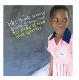
Repeat with another simple sentence.

Lagos-P5-Lit-w11-15-aw√.indd 20 12/10/15 10:08 AM