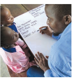
Choose some pupils to write both of the addresses and the date on the letter.