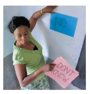
Put the 'yes', 'no' and 'don't know' cards in three different parts of the classroom.