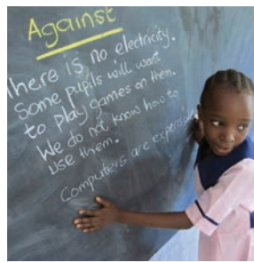
Ask pupils to write their ideas as simple sentences on the chalkboard.

Lagos-P5-Lit-w11-15-aw√.indd 36 12/10/15 10:08 AM