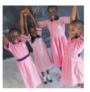
The group with the most words spelled correctly is the winner.

Lagos-P5-Lit-w11-15-aw√.indd 26 12/10/15 10:08 AM