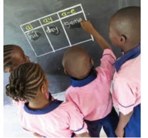
Ask the groups, in turn, to write each word in the correct place on the chart.