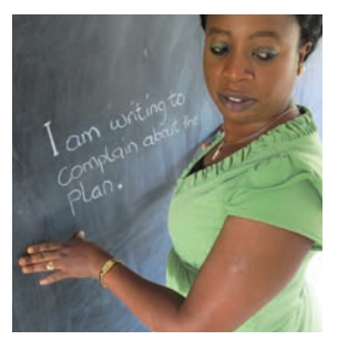
Repeat with, 'I am writing to complain about the plan.'