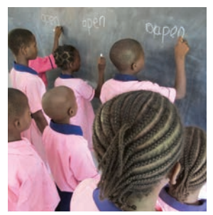
Ask a pupil from each group to write the first word on the chalkboard.