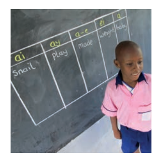
Ask some pupils to spell some of the long 'a' words on the chalkboard.

Lagos-P5-Lit-w11-15-aw√.indd 16 12/10/15 10:08 AM