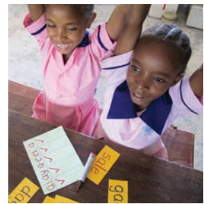
Tell the groups to shout 'Bingo' when they have a tick in each column.