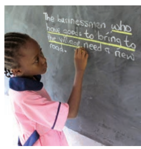
Ask pupils to think about why a new road is needed and add a clause to the sentence.