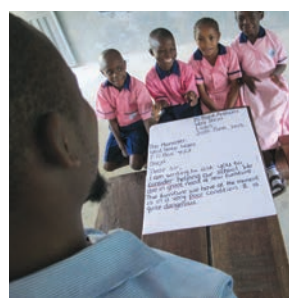
Ask them to suggest sentences for the third paragraph.