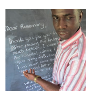
Read Yemi's letter (letter 2) to the class.