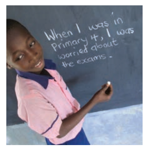
Remind them to use commas to separate the subordinate clauses from the main clauses.

Lagos-P5-Lit-w11-15-aw√indd 12 12/10/15 10:08 AM