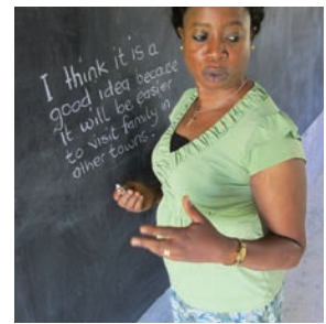
Ask them to say their reason in a sentence and write it on the chalkboard.