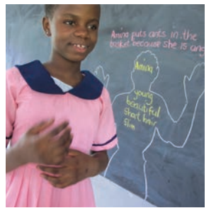
Discuss what Amina's actions tell us about her character.