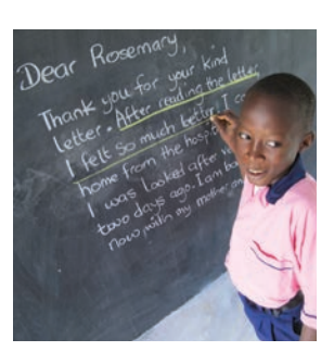
Choose a group to underline the complex sentences in letter 2.