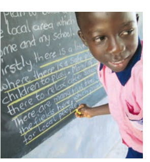
Ask the pupils to underline the reasons against the new road in the letter.