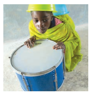
Tortoise with the drum,