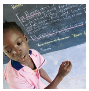
Ask, 'Does the letter have formal or informal words?'