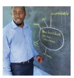
Write their ideas in the brainstorm.