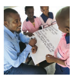
Ask them to suggest ideas to complete the first paragraph.