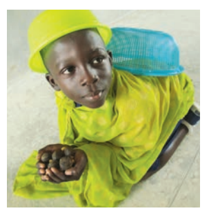
Tortoise collecting the nuts,