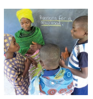
Ask the groups to discuss reasons for a new road.