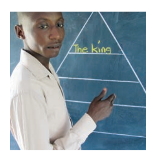
Repeat the process to complete a character pyramid for the king.

Lagos-P5-Lit-w11-15-aw√.indd 64 12/10/15 10:09 AM