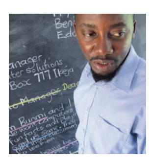
Ask, 'Does the letter have enough information?'

Lagos-P5-Lit-w11-15-aw√.indd 34 12/10/15 10:08 AM