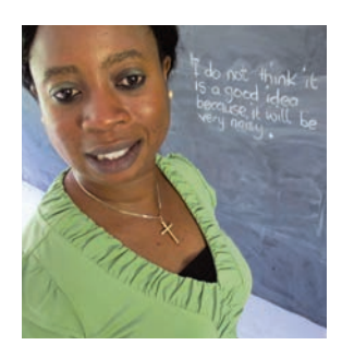
Ask them to say another reason in a sentence and write it on the chalkboard.

Lagos-P5-Lit-w11-15-aw√.indd 28 12/10/15 10:08 AM