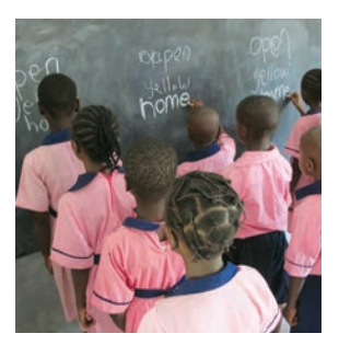
Repeat with the remaining words, making sure each pupil has a turn.