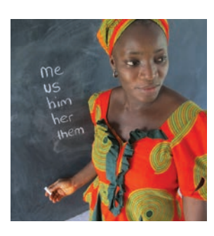
Explain that these pronouns are used to replace the noun when it is the object.