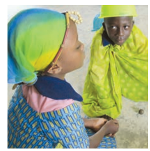
the king's wife and Tortoise,