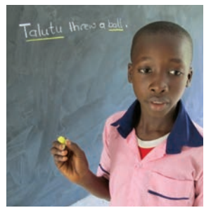
Choose some groups to underline the nouns in the sentences on the chalkboard.