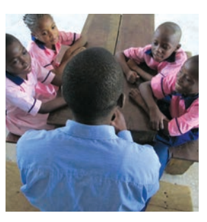
Ask the groups to discuss reasons for having computers.