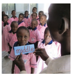
Read out the words on the flash cards.