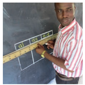
Draw a chart for the different spellings on the chalkboard.