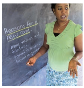
Write each idea on the chalkboard as a simple sentence.