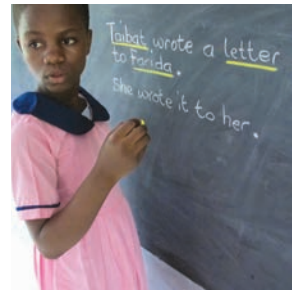
Ask them to write the sentences replacing the nouns with pronouns.

Lagos-P5-Lit-w11-15-aw√.indd 46 12/10/15 10:09 AM