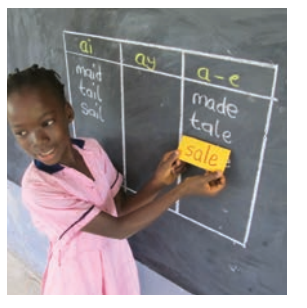
Remind the groups about homophones and ask if some words can go in two places.

Lagos-P5-Lit-w11-15-aw√indd 10 12/10/15 10:08 AM