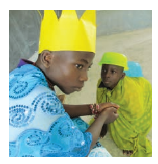
Tortoise and the king.

Lagos-P5-Lit-w11-15-aw√.indd 60 12/10/15 10:09 AM