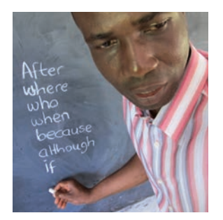
On the chalkboard, write the words that start each of the subordinate clauses.