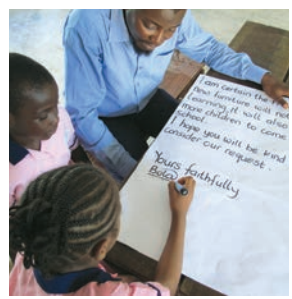
Ask the pupils how they will end the letter.

Lagos-P5-Lit-w11-15-aw√.indd 42 12/10/15 10:09 AM