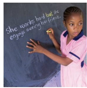
Ask the pairs to join the simple sentences with conjunctions to make compound sentences.

Lagos-P5-Lit-w11-15-aw√.indd 8 12/10/15 10:07 AM