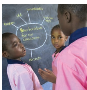
Keep this brainstorm for the next day.

Lagos-P5-Lit-w11-15-aw√.indd 38 12/10/15 10:08 AM