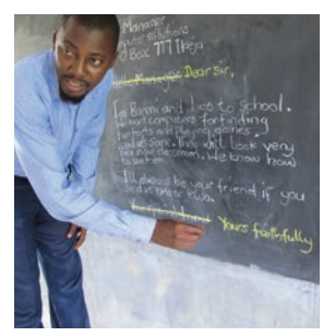
Ask, 'How should we begin and end a formal letter?'