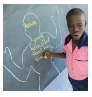
Draw Amina on the chalkboard and ask the pupils to describe her appearance.