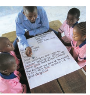
Tell the pupils to read through the letter so far.