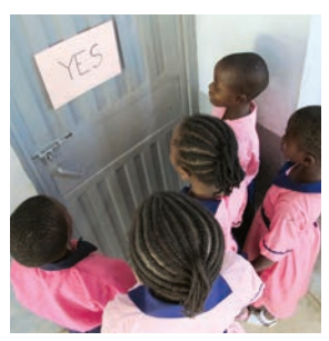
Ask the pupils to stand by the card they agree with.