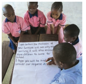
Ask the pupils to write their clear sentence in the letter.