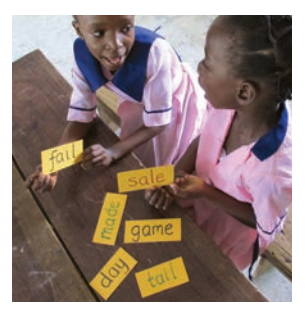
Read these words: 'day', 'fail', 'game', 'stay', 'same', 'paint', 'made', 'tail', 'sale'.