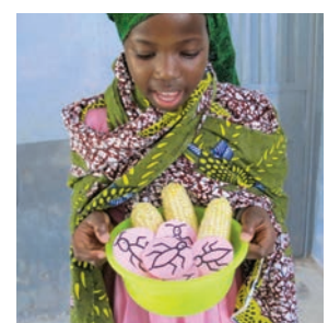
the neighbour finding the ants.