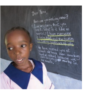
Choose some pupils to underline the compound sentences in letter 1.