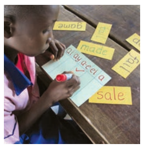
Eg: If you say 'snail', the groups should put a tick in the 'ai' column.