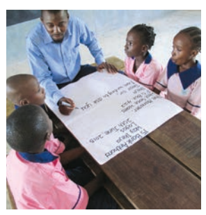
Tell them to write a polite greeting.