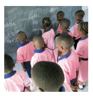
Ask pupils from each group to spell the words on the chalkboard.