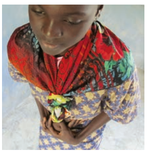
fruit trees dying and less food for the people,