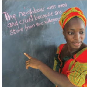
Discuss what the neighbour's actions tell us about her character.

Lagos-P5-Lit-w11-15-aw√.indd 52 12/10/15 10:09 AM