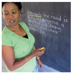
Show the pupils how to add a clause arguing against a reason.

Lagos-P5-Lit-w11-15-aw√indd 24 12/10/15 10:08 AM