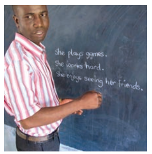
Write their ideas on the chalkboard as simple sentences.