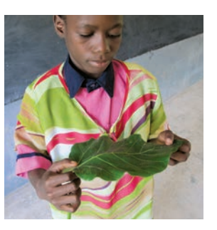
nowhere to learn about plants and animals.

Lagos-P5-Lit-w11-15-aw√indd 22 12/10/15 10:08 AM │