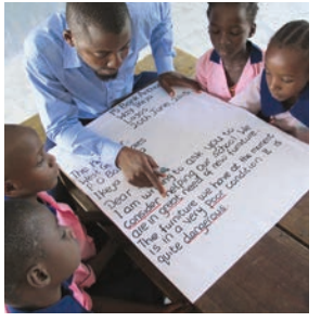
Encourage them to use the words/ phrases and wow! words.