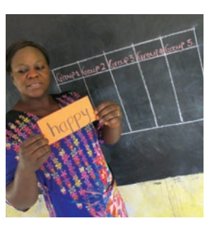
Read the first root word.