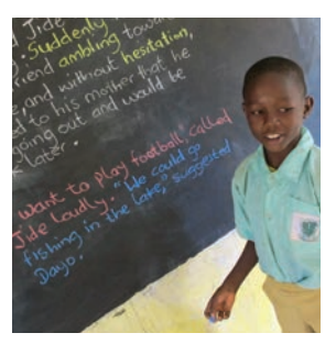
fishing in the lake,