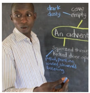
What was it like inside the shelter? What did the boys do?