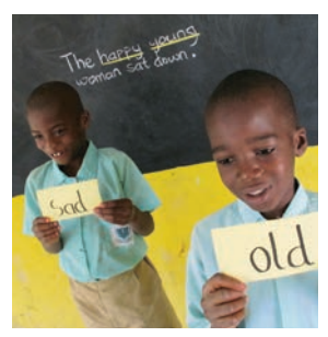
Ask some pairs to change the adjectives to make them mean the opposite.