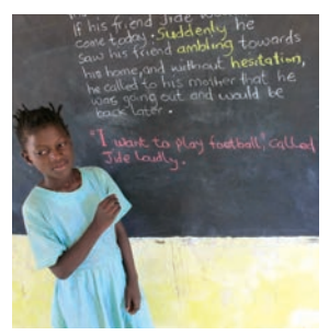
Add their ideas to the writing frame, eg: playing football,