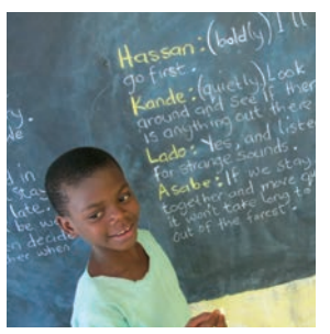
'What are they worried about?'

Lagos-P5-Lit-w16-20-aw√.indd 66 2/9/16 3:43 PM