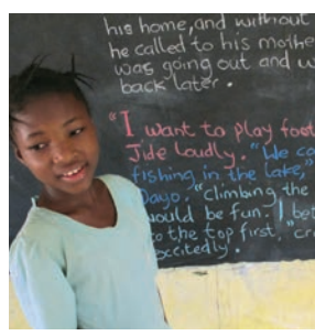
climbing the rocks.

Lagos-P5-Lit-w16-20-aw√indd 48 2/9/16 3:43 PM