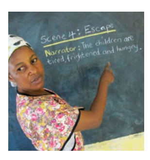
Ask the groups: 'What does the narrator say is happening in the shelter?'