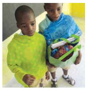
Role play the two men travelling to Umeh's town.