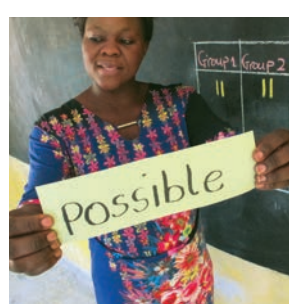
Repeat with the rest of the root words. The group with the most points wins.

Lagos-P5-Lit-w16-20-aw√.indd 42 2/9/16 3:42 PM