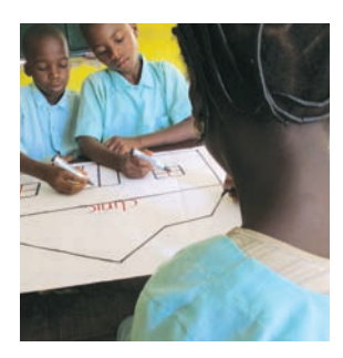
'What did Umeh want the money for?'

Lagos-P5-Lit-w16-20-aw√.indd 16 2/9/16 3:42 PM