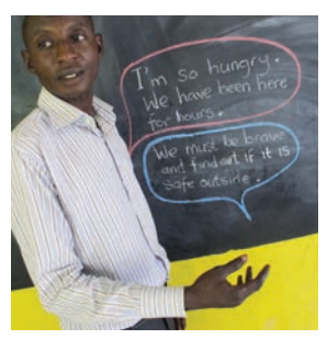
Write some of their speech on the chalkboard.