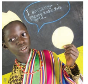
Write speech for, and role play, different resolutions.