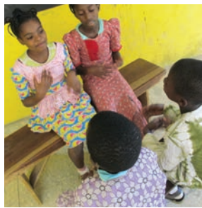
the ending when the children meet up years later.

Lagos-P5-Lit-w16-20-aw√.indd 40 2/9/16 3:42 PM