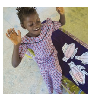
Ask the groups to role play waking up and finding cockroaches in their homes.