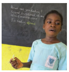
Ask each of the other pupils to complete one of these sentences: 'I feel...'