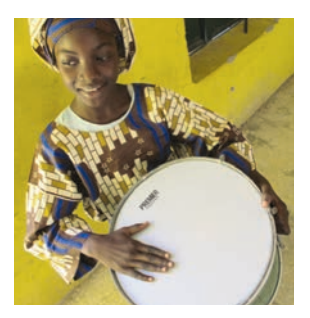
Role play what the chief agreed to do and what happened.