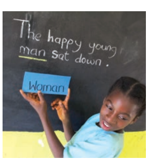
Choose some pairs to change the noun.