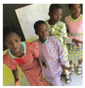
the build-up where the children are in the forest,