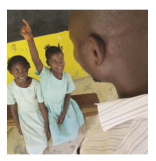
children at school,