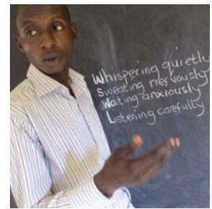
Ask the pupils to say some adjectival phrases to describe the boys in the shelter.

Lagos-P5-Lit-w16-20-aw√.indd 54 2/9/16 3:43 PM