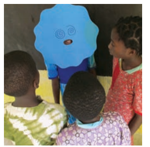
the resolution when the lake replies to the children,