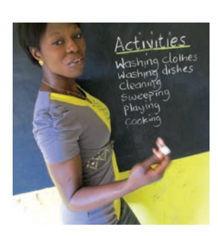
Ask each group to help you list and role play village activities.