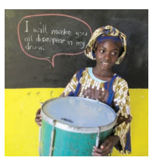
Role play ideas for a challenge facing the wise woman, eg: not getting paid.