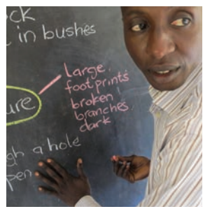
What did the boys see when they went outside?