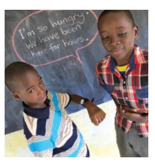
Ask the pairs to role play the boys talking about leaving the shelter.