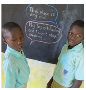
Choose other pupils to think of more things that the boys might say.