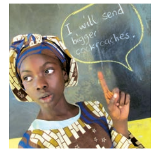
Ask, 'What did the wise woman threaten to do?'.