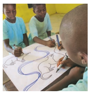
'What happened to the rats?'