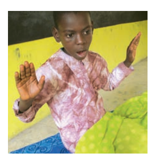
Choose a pupil to role play, 'Nervously, Tunde got out of bed.'