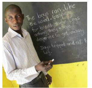
Ask each group to say what happened as the boys ran away.