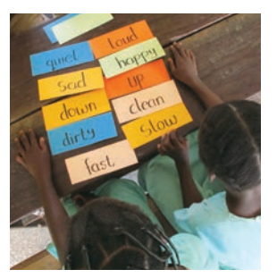
Continue until all the cards are used up.