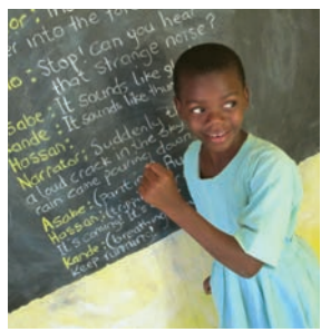
Role play running to the shelter and complete scene 2.

Lagos-P5-Lit-w16-20-aw√indd 62 2/9/16 3:43 PM