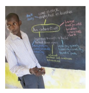
How did the boys feel when they got home?

Lagos-P5-Lit-w16-20-aw√.indd 52 2/9/16 3:43 PM