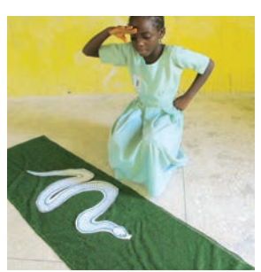
Ask them to role play, 'Bravely, Lola looked for snakes.'