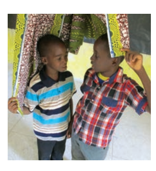
Ask the pairs to role play the boys talking inside the shelter.