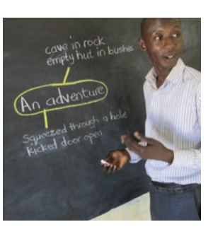
Where did the boys find a shelter? How did they get in?