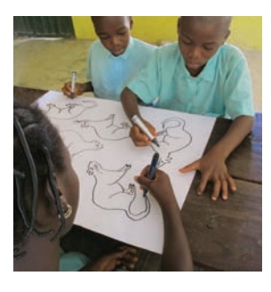
'What was the problem when the rain came?'