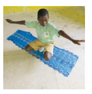
Ask them to role play, 'Proudly, the bird flew into the water.'

Lagos-P5-Lit-w16-20-aw√.indd 34 2/9/16 3:42 PM