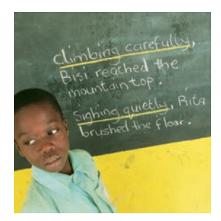
Write the new sentences and underline the adjectival phrases.

Lagos-P5-Lit-w16-20-aw√.indd 38 2/9/16 3:42 PM