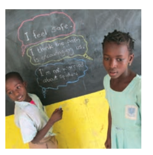
Ask the groups to write thought bubbles for the children as they are walking.

Lagos-P5-Lit-w16-20-aw√.indd 36 2/9/16 3:42 PM