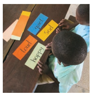
If the words are opposite, the pupil keeps the cards.