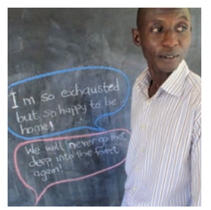
Ask the pairs to role play the boys leaving and write their speech.