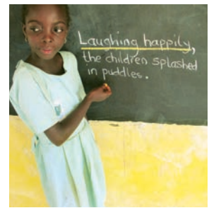
Repeat this process with the other sentences.