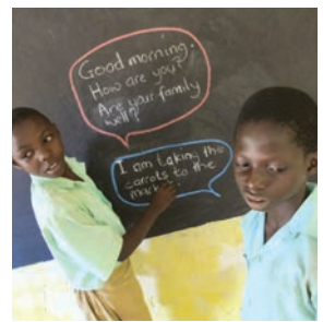
Ask the groups to write speech in the speech bubbles for the people.

Lagos-P5-Lit-w16-20-aw/.indd 20 2/9/16 3:42 PM