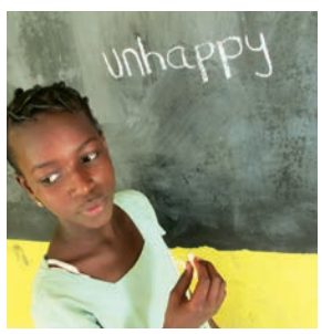
Give another point if they can write the new word on the chalkboard.