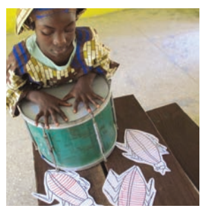
Ask the groups to role play the wise woman getting rid of the cockroaches.