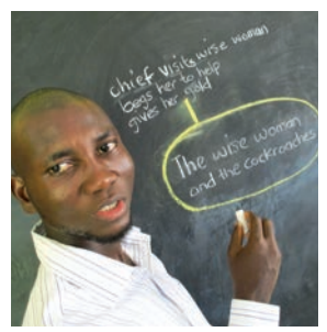
Role play what the people decided to do about the cockroaches.