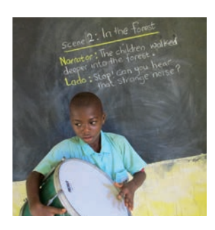
Write the beginning of scene 2 and choose some pupils to bang the drum.