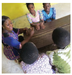
Ask the groups, 'What are the children thinking at the beginning of the story?'