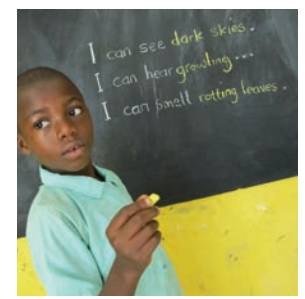
'I can see...' 'I can hear...' 'I can smell...'