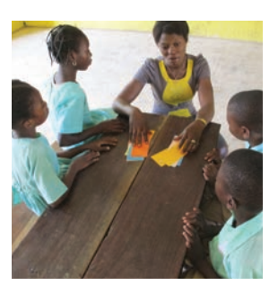
Shuffle the opposite word cards and place them face down in front of each group.