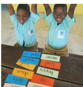
The winner is the pupil with the most cards.

Lagos-P5-Lit-w16-20-aw√.indd 8 2/9/16 3:41 PM