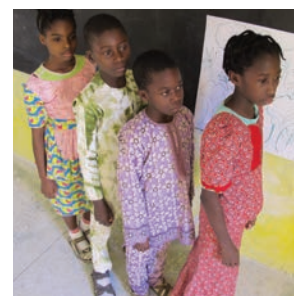
Ask the groups to role play walking along the path through the forest.