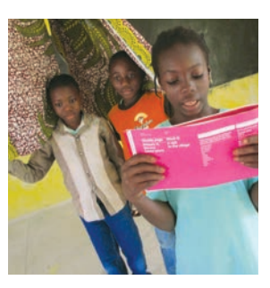
Ask the narrator to explain the setting and how the children get into the shelter.