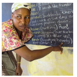
Try to include stage directions.