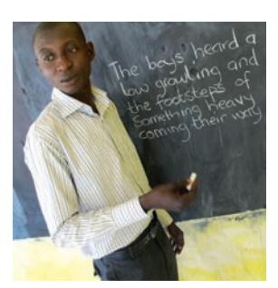
Write their ideas in sentences.