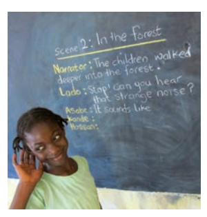
Role play the children hearing strange noises and write their speech.