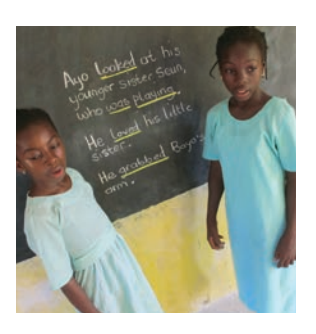
Choose some pairs to underline the verbs in the sentences and say the tense.