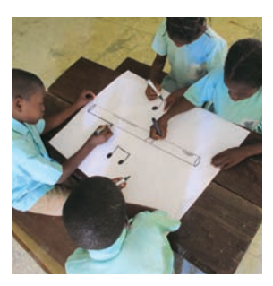
'What did Umeh bring to the village with him?'