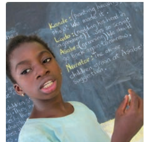
'What do the children say and do at the end of the playscript?'

Lagos-P5-Lit-w16-20-aw√.indd 68 2/9/16 3:43 PM