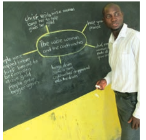
Role play what happened when the chief refused to pay the wise woman.