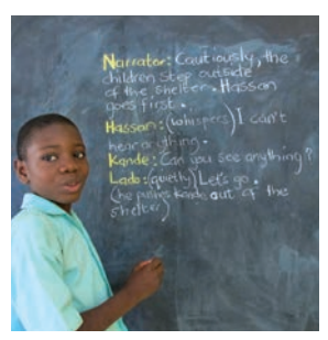
'What do the children do and say when they are back in the forest?'