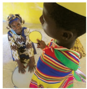
Role play the resolution and the ending.

Lagos-P5-Lit-w16-20-aw√.indd 24 2/9/16 3:42 PM