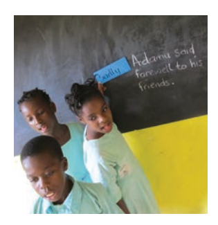
Ask each group to choose an adverb opener for a sentence.