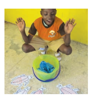
Ask the groups to role play finding cockroaches in other places.