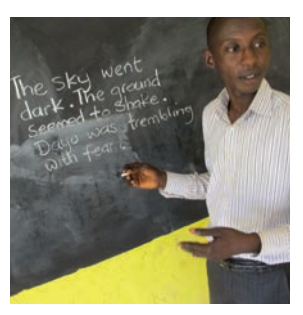
Ask the groups to help you write sentences about what the boys saw and felt.