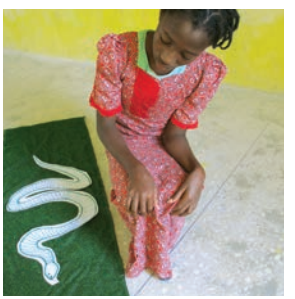
Choose a pupil to role play, 'Quietly, Lara looked at the snake.'