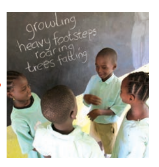
Ask the groups to describe the sounds the boys might hear next.