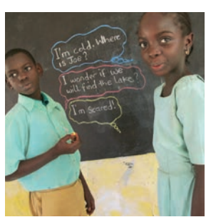
Ask the groups to write their ideas in the thought bubbles.