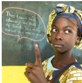
Ask the pupils to write speech for, and role play, the endings.

Lagos-P5-Lit-w16-20-aw√.indd 28 2/9/16 3:42 PM