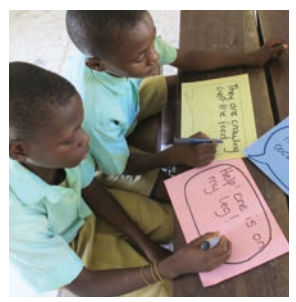
Ask the groups to write speech for the people in the speech bubbles.