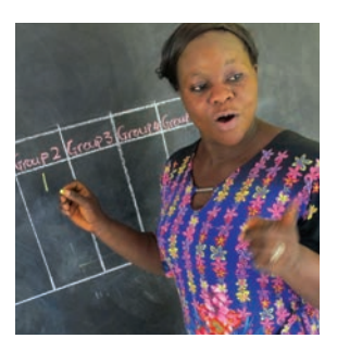
Give a point to the group holding the first correct prefix.