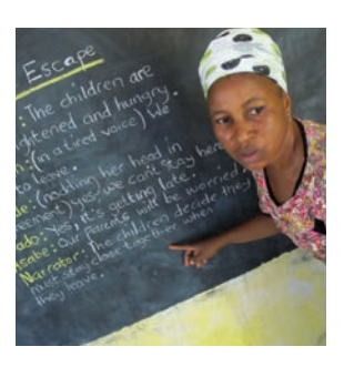
'How do they leave the shelter?'