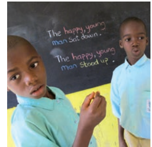
Tell some pairs to change the verb and the preposition.