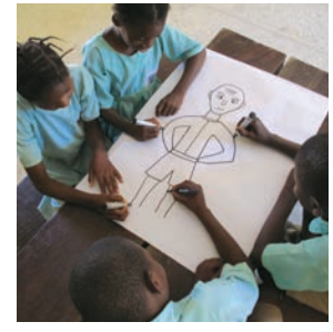
'Why did Umeh play the flute for the children?'