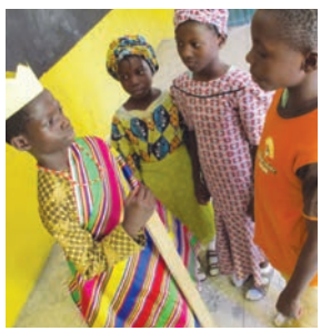
Ask them to role play the meeting with the chief.