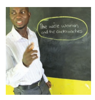
Ask, 'What shall we call our folk tale?'