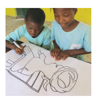
Choose some pairs to draw a picture to explain the first sentence on the chalkboard.