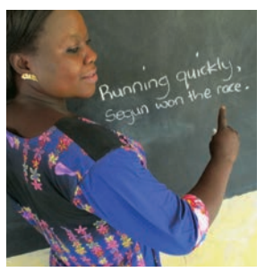
Explain that the comma separates the extra information from the rest of the sentence.