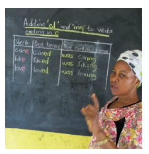
Explain that: verbs ending with 'e' drop the 'e' and add the suffix.