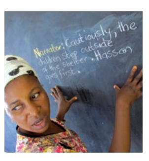
Ask the groups: 'How do the children leave the shelter?