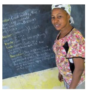
'What happens to the children at the end?'