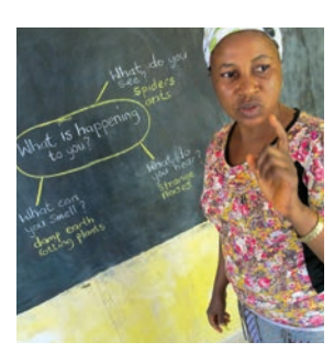
Write some of their ideas in a brainstorm.

Lagos-P5-Lit-w16-20-aw√indd 64 2/9/16 3:43 PM