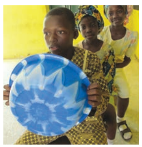
Choose some groups to role play: people working,