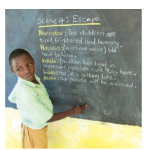
'What do the children say?' 'Why do they decide to leave?'