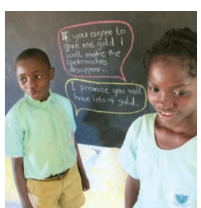
Ask the groups to complete speech bubbles for the wise woman and the chief.