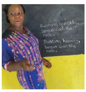
Ask, 'How did she do this?' and write their ideas on the chalkboard.