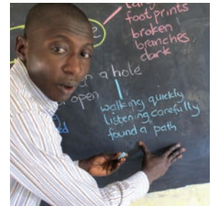
How did the boys get home?