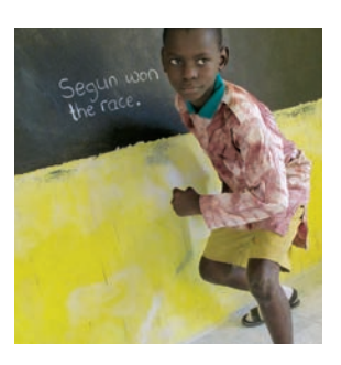
Ask the groups to role play the first sentence.