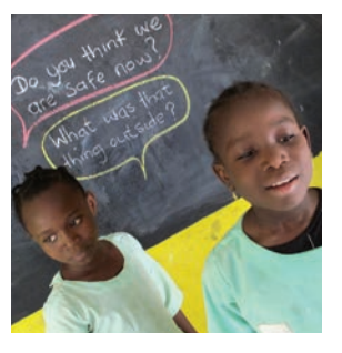
Choose some pairs to write speech bubbles for the boys.