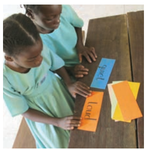
Ask the pupils, in turn, to turn over two cards.