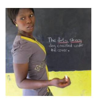
Repeat with the other sentences.

Lagos-P5-Lit-w16-20-aw√.indd 12 2/9/16 3:41 PM